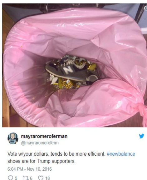
Figure 2: Image posted online with New Balance shoes thrown to garbage by anti-Trump customers

“In the wake of the deeply divisive US presidential elections, brands were wise to keep out. But New Balance was accidentally drawn in. Anti-Trump websites misquoted a New Balance spokesperson saying Obama had let them down and with Trump ‘things are going to move in the right direction’. While the spokesperson was referring to the Trans-Pacific Partnership only, the internet seized the quote and repackaged the message: New Balance offers a wholesale endorsement of the Trump revolution . It led to alt-right groups praising it as a brand for white Americans, while anti-Trump groups burning their New Balance shoes and sharing the ritual online.” 9