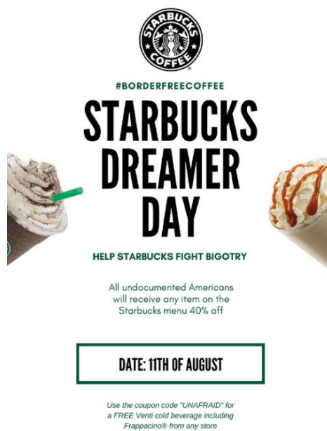
Figure 3: Fake news spread in social media about Starbucks “Dreamer Day”

“Advertisements including the company’s logo, signature font and pictures of its drinks were circulated with the hashtag ‘#borderfreecoffee’. But it was a hoax . Starbucks raced to deny the event, replying to individuals on Twitter that it was ‘completely false’ and that people had been ‘completely misinformed’. Yet the rapid spread of the fake news showed again the power of social platforms to damage reputations, and illustrated how companies should be more vigilant and creative in responding.” 10