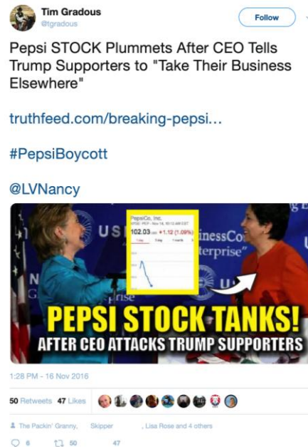
Figure 1: Fake news spread on Twitter about Pepsi Co CEO Indra Nooyi statement 8

jumped on the fictitious quote, with people threatening to boycott all of Pepsi's brands using the hashtags #boycottPepsi and #Pepsiboycott." 7