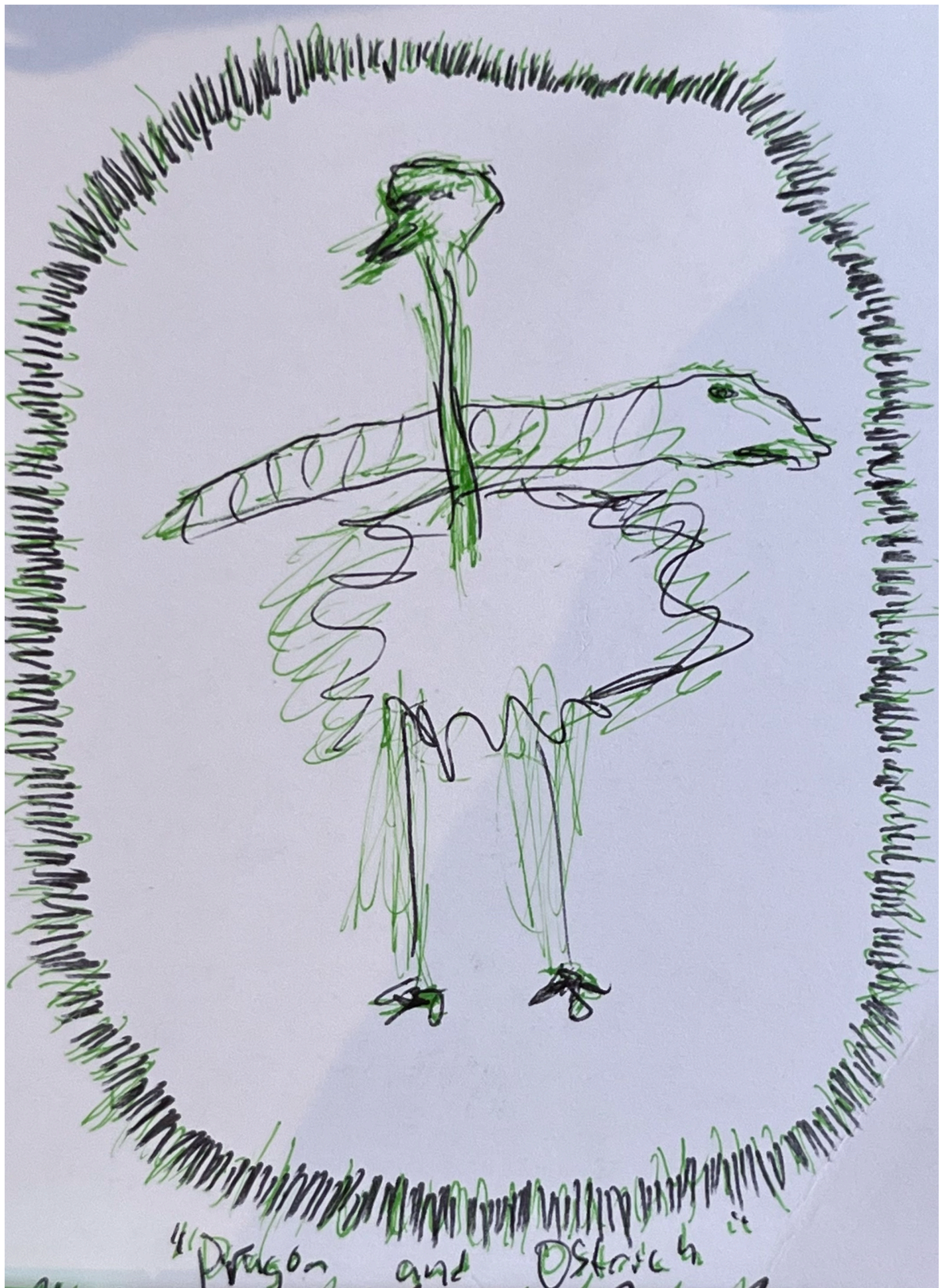
"Dragon and Ostrich"