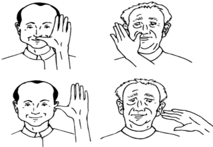
Figure 6: Meaningless Gestures

into account hesitation/searching movements or self-corrections during the course of the movement nor did it consider minor variation of the angle of the hand or of the degree of extension of single fingers. While healthy subjects and subjects with right-hemisphere damage could perform these imitations virtually flawlessly, apractic patients make all sort of mistakes (cf. right column in Fig. 6). The contrast between imitation of meaningless gestures and evocation of familiar gestures from long-term memory was particularly impressive when the shapes of the intended gestures were similar. For example both patients correctly touched the temple with the middle finger of the horizontally extended hand when demonstrating a military salute but searched in vain for the correct position of the hand when imitating a gesture which consisted of placing the thumb of the vertically extended hand to the ear.