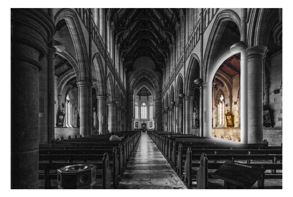
Figure 2.1: Imaginary virtual memory palace with a suggested locus highlighted.

of potentially enhancing the virtual memory palace. Is it possible to go beyond the technique's traditional limitations? And if so, how?