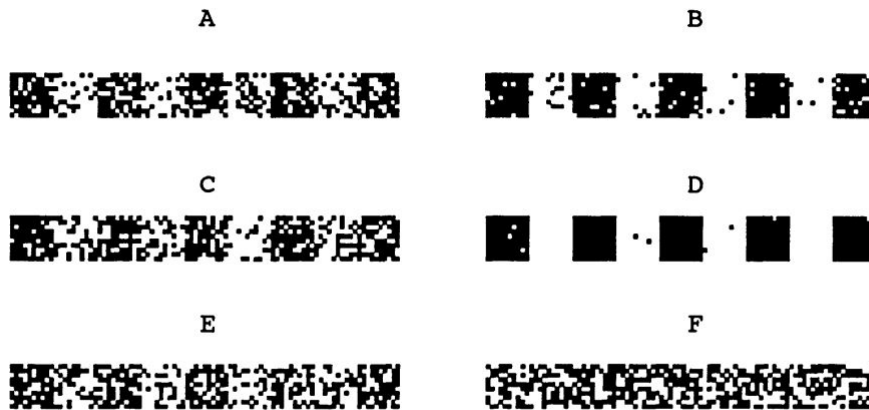
Figure 3: Six different objects, in each case the ability to describe the pattern as a checker-board varies. Whether or not we want to take the existence of the pattern as real depends on our desired margin of error [26]