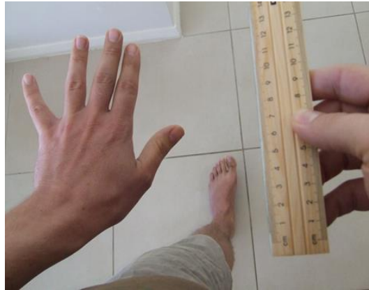
Figure 1. Measuring Perspectival Size. Holding a ruler fixed at the same distance as my hand, my foot measured as a third of the perspectival size of my hand on the ruler.

If this procedure accurately measures visual area, then my hand currently takes up more than three times the visual area of my foot (I will be arguing that this method does not typically measure visual area). Why hold the ruler close to the hand rather than closer to the foot? Where you hold the ruler does not make an important difference because whilst the units will change the ratio remains constant. Perhaps my foot will be measured as 10 cm, while my hand will then be measured as 30 cm. My foot will continue to be measured as a third the size of my hand, where ever I hold the ruler, unless of course I change the distance between my hand and my foot, or the relative position of the ruler. This method abstracts away from depth and thus provides a first-person means of measuring perspectival size on the vertical and horizontal axes.