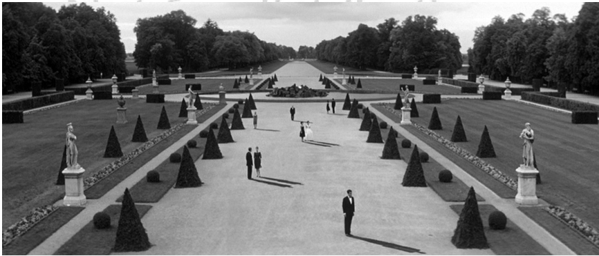
Figure 2.1 A life-world without nature, without materiality; without life, without world: Last year in Marienbad .

Marienbad , as I see it, demands to be read as an allegory of our civilization, inasmuch as it shirks the kind of possibility offered by Hiroshima (and by Gravity ; and by Waltz With Bashir ; and in a sense by most of the films in this book). It is a nightmare of reason. And reason as a nightmare. Bringing to mind G.K. Chesterton's great epithet: 18 that the madman is not the man who has lost his reason, but rather the man who has lost everything but his reason. This, I suggest, is the meaning of the sterility of the chateau and the gardens; and above all of the deeply puzzling way in which the film ends. Why can't the (anti-)hero and heroine get away when they finally decide to flee, after the tall thin man whose is the heroine's husband gives up on trying to stop them? Because they are stuck in a world where only the people, or (to be more precise) only their more or less Cartesian minds, are real, present. Thus the absence of anything but the people having true shadows, in one epochal scene in the film: