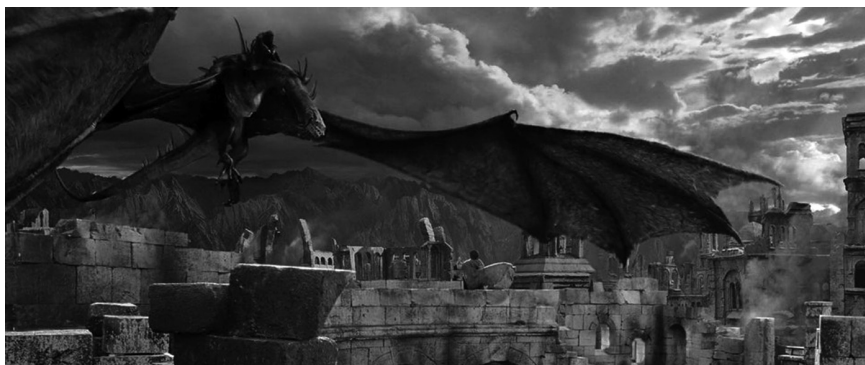
Figure 6.1 Facing a vastly (but not infinitely) greater foe: Frodo and the Nazgul.

prey. Frodo then wants to lose the burden of the Ring, tired of and desperate to escape from the entire situation in which he has found himself, and makes as if to give it to the king of the Ring-wraiths. Feeling undone by the overwhelming hostile external force that he does not realize he has himself called to him, he seeks for a moment to be rid of it that way, too.