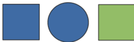
Figure 3. From Frank & Goodman (2012)

The same thing goes for other pragmatic frameworks like the Rational Speech Act framework (RSA). RSA provides an account of how speakers and hearers use Bayesian inference to recursively reason about what state of the world is likely to be like given that a speaker made some utterance while reasoning about how a listener is likely to interpret that utterance. A simple RSA model might assume a uniform prior probability distribution on which objects (or restrictions) are all equally likely. But, RSA is compatible with it being the case that our prior probabilities supply a higher likelihood to restrictions being made by, say, location than by history, how funny something is, or its color. For instance, Frank & Goodman (2012) and Qing & Franke (2015) consider priors related to perceptual salience (how attention-grabbing something is in one's environment). Consider a simple conversational setup in which a speaker and a hearer are engaged in using signals to refer to some object in the array shown in Fig. 3 .