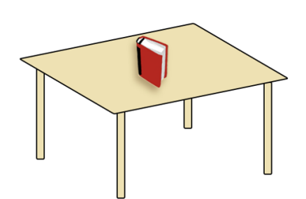
Figure 1. One book on a table

Different judgements about (1) would be warranted if the depicted scenario was of an empty table, or of a table with a book under it, or of a table with one book on it and another book under it. The literature is full of answers to questions about the meaning of sentences like (1) in context (as well as the context-invariant contribution made by sentences like it). For instance, since there are many books in the world and definite singular phrases are thought to require uniqueness,<sup>1</sup> one could hold that (1) expresses