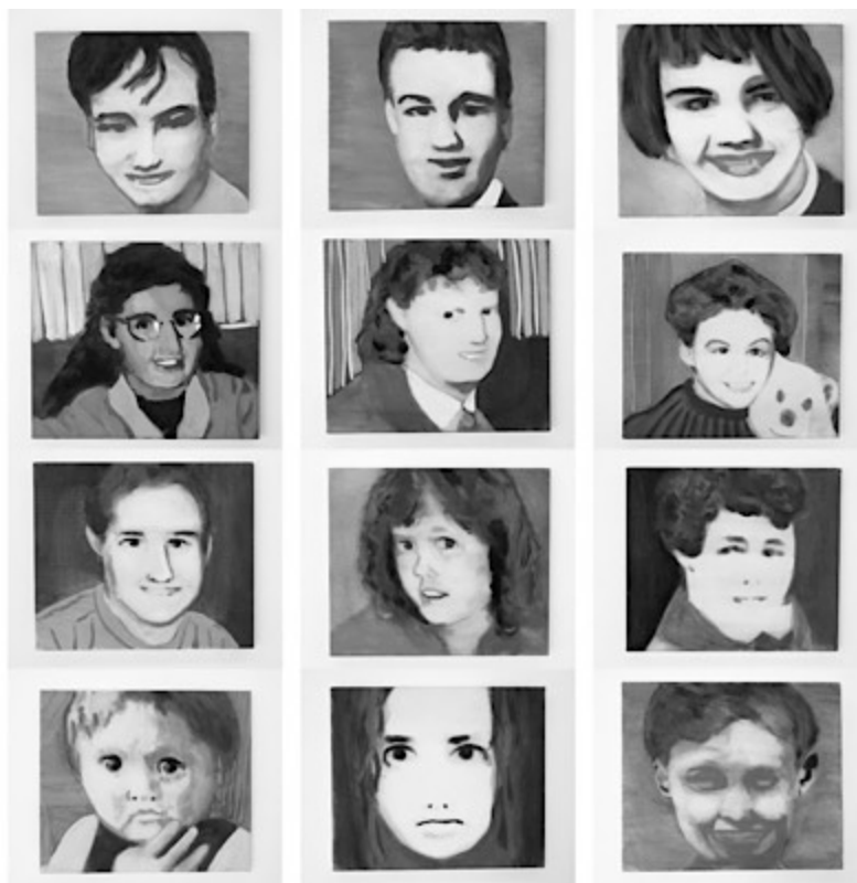
Fig. 7.7. Martin Lang, Twelve Portraits of Missing People from Soul Asylum's Runaway Train Video (1993) , all 2021, oil and digital print on canvas. 35cm x 30cm. Property of the artist. © Martin Lang.