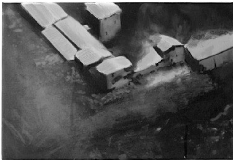
Fig. 7.3. Martin Lang, Mount Carmel Center on Fire (19 April 1993) , 2021, oil and digital print on canvas. 37cm x 25cm. Property of the artist. © Martin Lang.

This fictional distrust of the government shown in The X-Files was played out in real life in 1993, in Waco, Texas. The Branch Davidians certainly had their own “truths” about government intrusion on religious rights, which they followed to the end—burning to death inside the Mount Carmel Center (Fig. 7.3). They had prophesised an apocalyptic moral struggle and stockpiled weapons for coming fight. What if they were right? What if religion and morality were the first casualties in a war of capitalist greed represented by the NAFTA and EU trade deals? I listened to podcasts about Waco, watched several documentaries and viewed over five hours of courtroom footage from the subsequent trial. It is far from certain what happened during the Waco Siege and initial accusations that the Branch Davidians chose mass suicide over surrender are certainly contentious, to say the least. We may never know the truth about what happened at Waco. The forensic evidence to support claims about who fired first (the Branch Davidians or the Bureau of Alcohol, Tobacco, Firearms and Explosives) includes a metal door, which of course could not have burned in the fire and yet is missing.