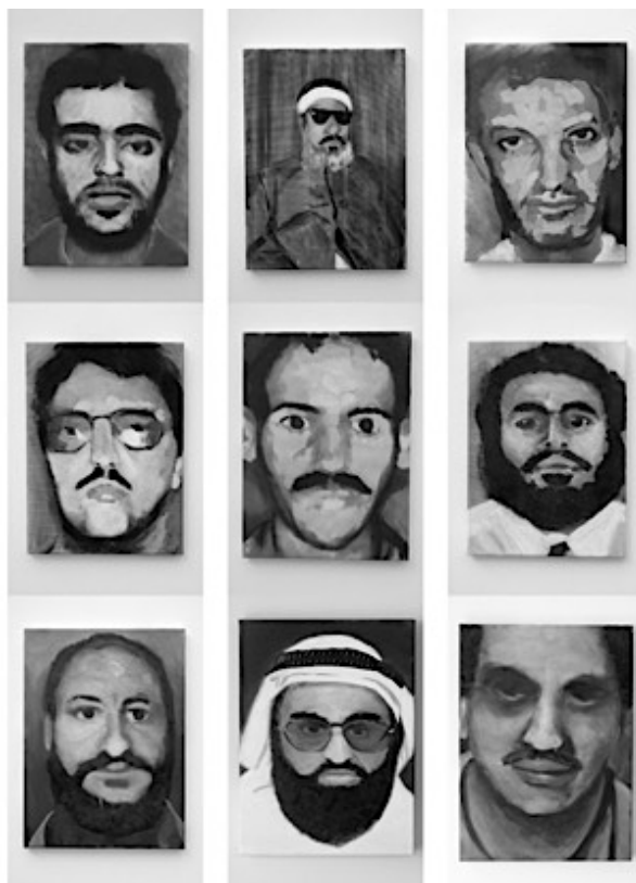
Fig. 7.5. Martin Lang, Nine Portraits of the World Trade Center Bombers , all 2021, oil and digital print on canvas. 30cm x 42cm each. Property of the artist. © Martin Lang.

Some have since died of natural causes. Khalid Sheikh Mohammed (bottom row, centre) was apprehended and is currently in Guantanamo Bay for his role in the 9/11 attack. He was not initially charged with the 1993 attack but confessed to masterminding it. During his interrogation by the CIA, Mohammed was subjected to waterboarding more than 180 times. 4 He is generally believed to have bankrolled the 1993 bombing, but his nephew, Ramzi Ahmed Yousef (Fig. 7.5, top right and Plate VII), is believed to have masterminded it. Yousef was also implicated in the 1993 Benazir Bhutto assassination attempt. Abdul Rahman Yasin (Fig. 7.5, bottom right) is the only convicted WTC bomber to escape justice. He was arrested and detained in Iraq. The Iraqi authorities informed the Americans of his capture and that he had crucial information regarding the bombing. Inexplicably, the US did not respond, and he was subsequently released (but he remains on the FBI most wanted list). The Twin Towers, representing global trade, were a symbolic target for religious indignation long before 9/11.