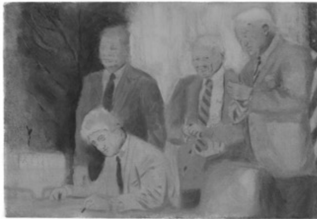
Fig. 7.1. Martin Lang, Clinton Signs NAFTA (8 December 1993) , 2021, oil and digital print on canvas, 37cm x 25cm. Property of the artist. © Martin Lang.