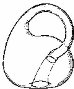
Figure 2. The Klein bottle

There exists a higher-dimensional counterpart of the Moebius surface. By way of introduction, consider an interesting attribute of the Moebius: its asymmetry. Unlike the cylindrical ring, the Moebius has a definite orientation in space; it can be produced either in a left- or right-handed form (depending on the direction in which it is twisted). If both a left- and right-oriented Moebius surface were constructed and then "glued together," superimposed on one another point for point, a Klein bottle would result (Lacan's passing allusion to this topological structure is cited above).