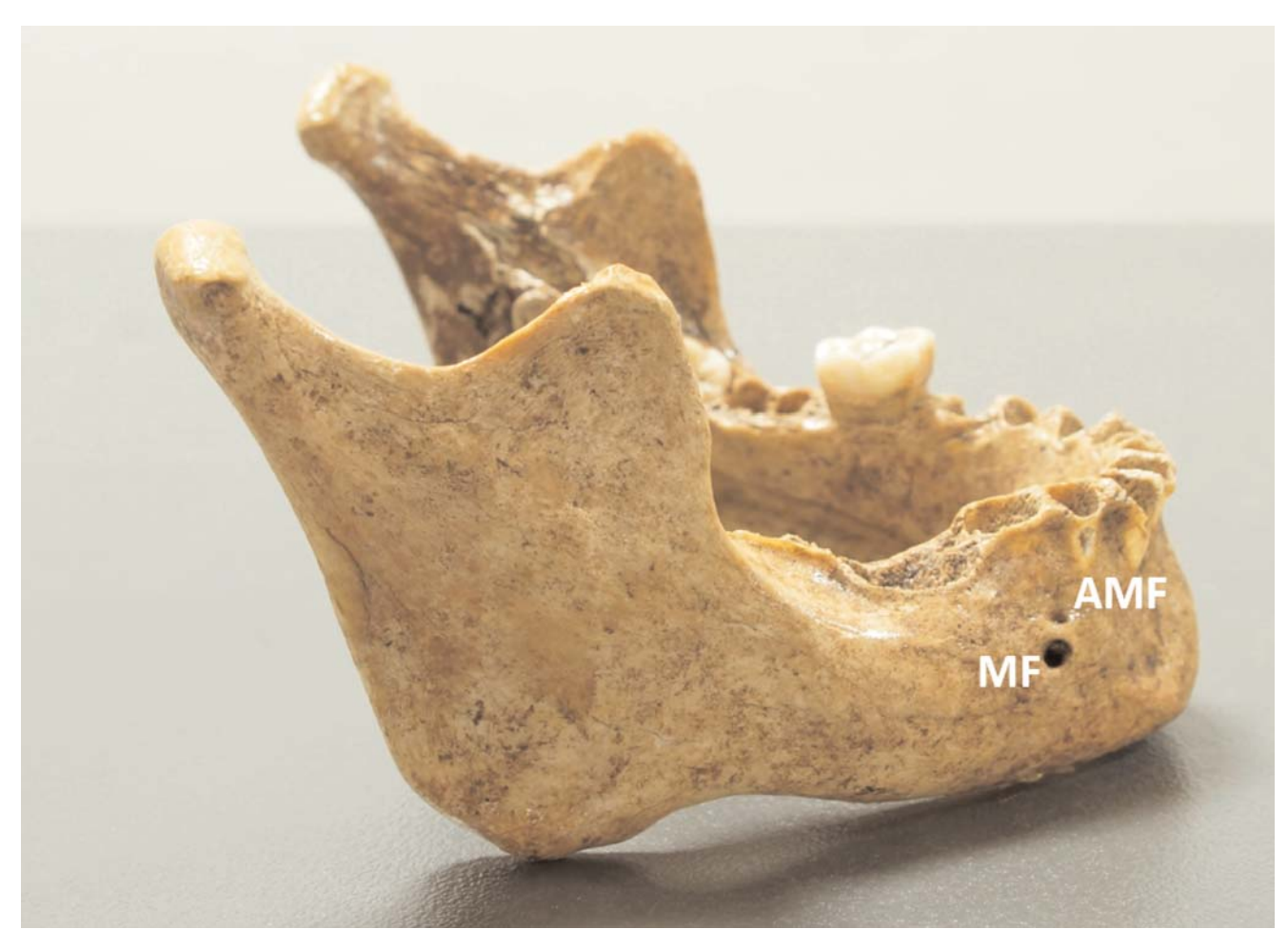
Figure 1. The mental foramen (MF) and accessory mental foramen (AMF) in a mandible.

Eleven (15.71%) accessory mental foramens were detected in 35 mandibles (70 sides) ( Figure 1 ). Six (54.55%) of the accessory mental foramens were on the left side, and 5 of