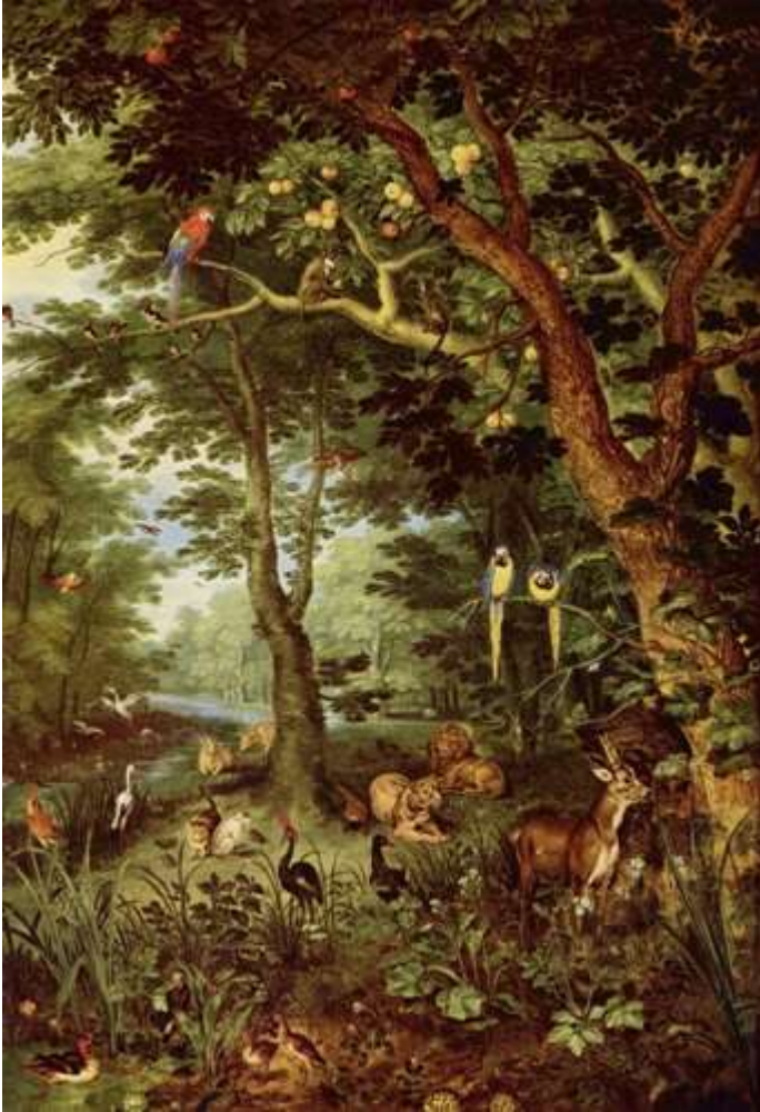
(Paradise, by Jan Bruegel)