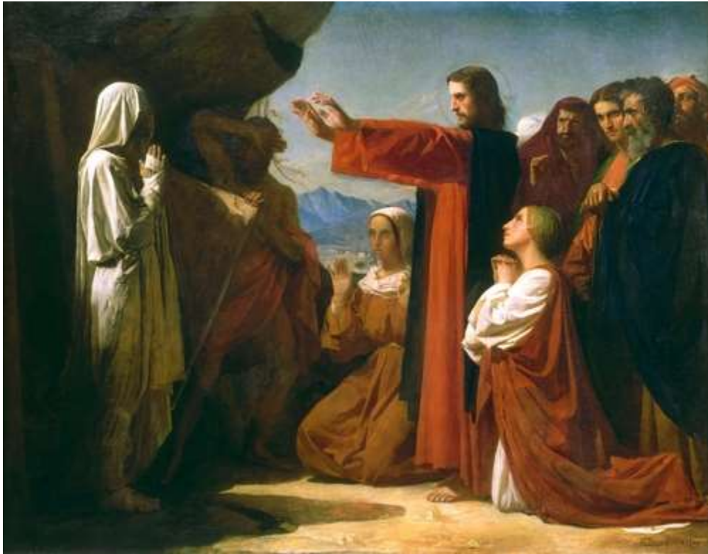
(The Resurrection of Lazarus, painting by Leon Bonnat, France, 1857.)

The souls that go to Purgatory are like the damned, they are deprived of the vision of God (the "beatific vision") and feel the regret of not doing all the possible good. Once purified, these souls leave Purgatory to Paradise and finally can "see God" (the damned will never see God). Only the perfectly pure people can go straight to Heaven: Jesus, Mary, for example.