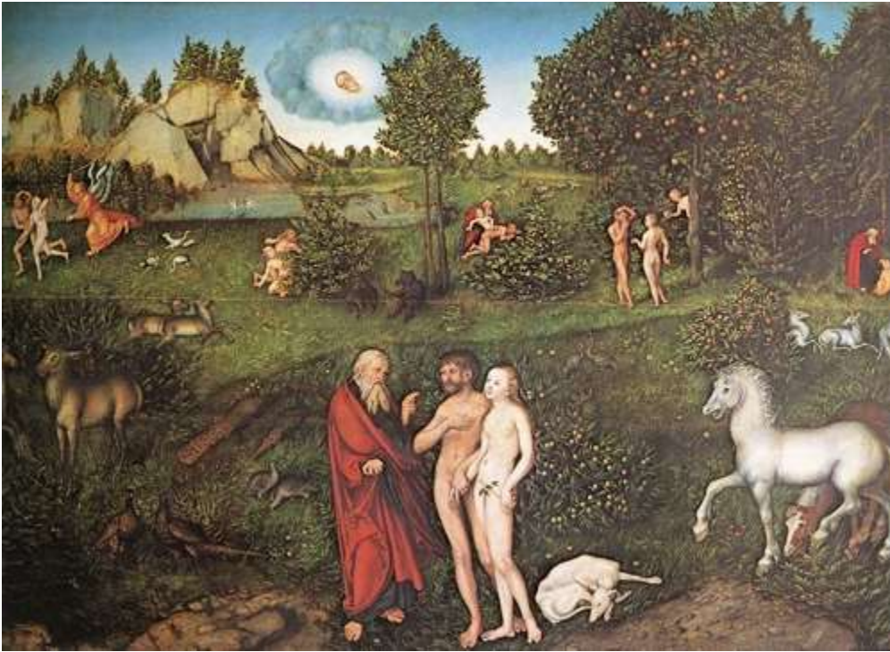
( Adam and

The tree of knowledge of good and evil , present in Paradise is an allegorical picture of the Book of Genesis according to which God planted in the Garden of Eden "two mysterious trees":