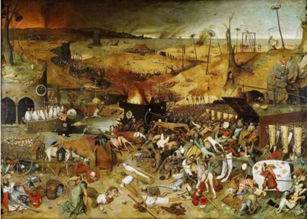
(The Triumph of Death, painting by Pieter Brueghel the Elder, the sixteenth century.)

There are, in all mythologies, gods who embody the Dead or some of its aspects: Ankou (Breton), Anpu (Egyptian), Anubis (Egyptian), Thanatos (Greek), Azrael (Angel of Death in Islam), Camard, Grim reaper (Anglo-Saxon culture), Hel (Scandinavian), Izanami (Shinto), Mictlantecuhtli (Aztec), Morrigan (Irish), Password (Canaanite), Orcus (Roman), Odin (Scandinavian), Pluto (Roman), Shemal (Semitic), Shinigami (Japan), Sielulintu (Finnish), Yama (Hindu), Yanluowang (Chinese)