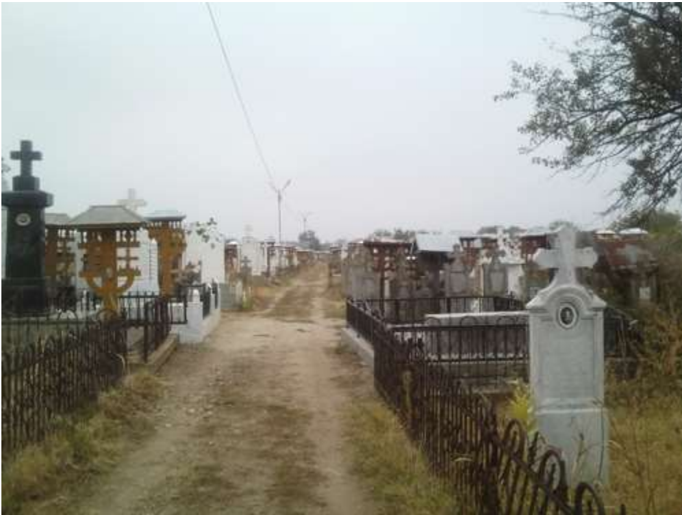
(The graveyard from Poiana Mare, Romania)

Death is a concept for the state of a biological organism having ceased to live (although this term is also used figuratively for the degeneration of a star, or a language that has lost its last speakers). This state is characterized by a definite break in the consistency of vital processes (nutrition, respiration ...) necessary for homeostatic maintenance of the organism, that distinguishes the death of a temporary alteration as in the case of hibernation or some freezing.