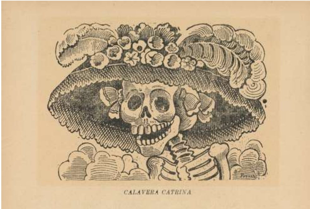
Calavera Catrina ", of José Guadalupe Posada (1913).)