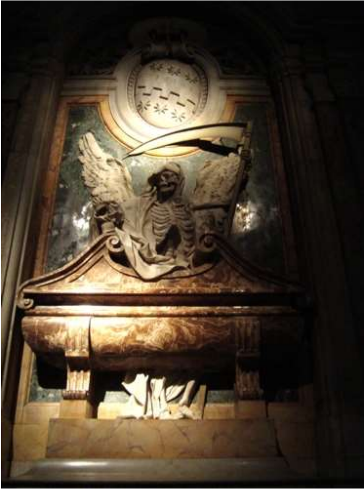
("The Grim Reaper" on the tombs of the churches,)

Death is sometimes mentioned in the New Testament, either in the form of impersonation, or as a statement of fact. She is equated with the evil angel Samael. There is a hint in the Acts of the Apostles (2:24): " But God gave him back to life, having made him free from the pains of death because it was not possible for him to be overcome by it."