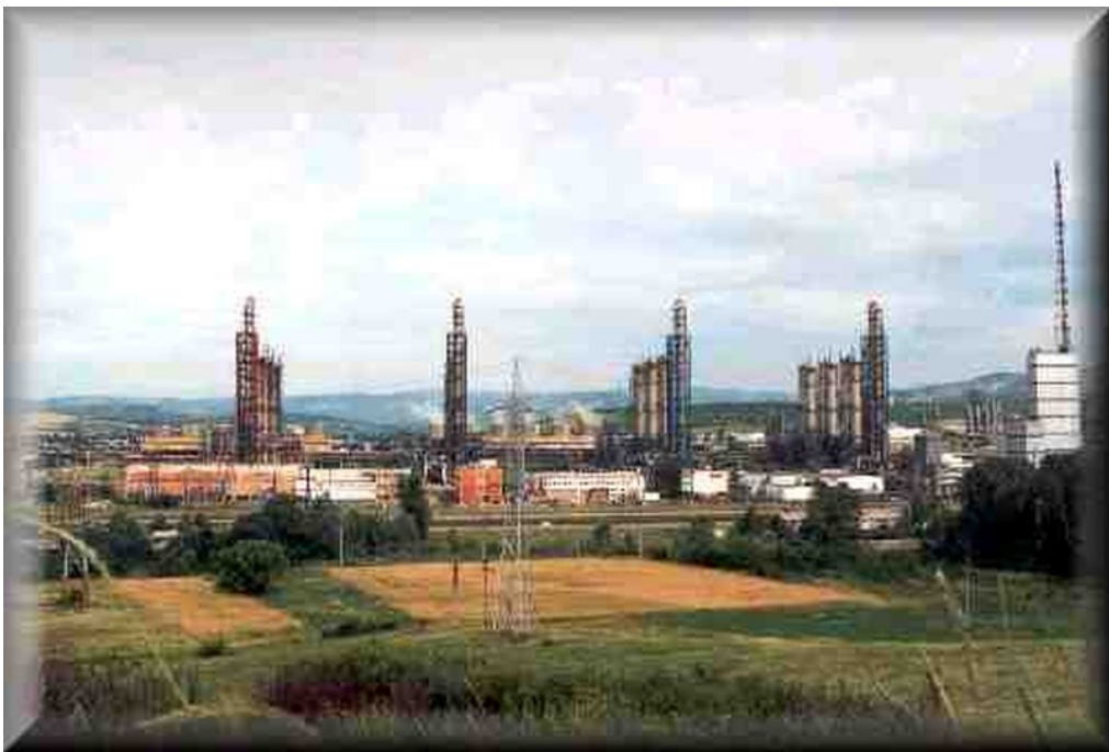
Figure 4. Heavy Water Plant - Overview.

which are the increase in fuel combustion efficiency, thus achieving an economy of uranium and decreasing the corrosion rate.