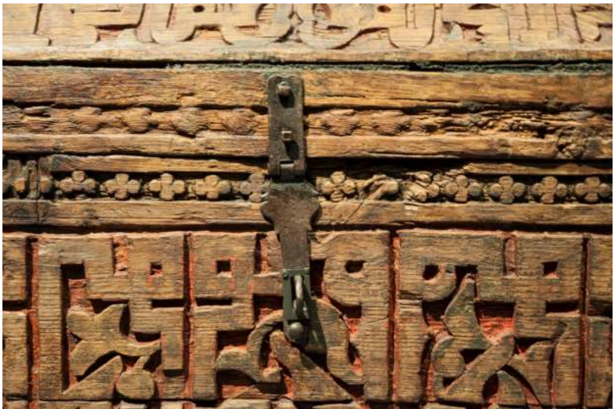
(Coffer, Fez, XIVth, https://commons.wikimedia.org/wiki/File:Coffre-_Fès_14_ème_siècle._Louvre_Paris.jpg)

Louvre Museum includes various rich collections of works of art from different civilizations, cultures and eras. It includes about 460,000 pieces, without the deposits in other museums that remain on its inventories, and 554,498 with deposits, including about 225,000 graphic works (237,559 worksheets for albums, as of January 1, 2016) and 38,000 exhibited works. For reasons of conservation, it is impossible to show the drawings for more than three consecutive months. The rest of the collections are made up of secondary works or archaeological series.