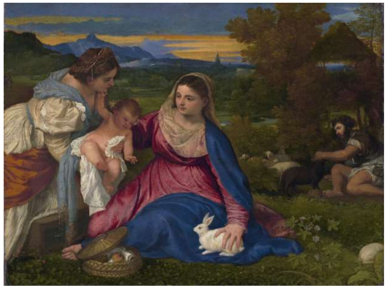
(Titian, La Vierge au Lapin à la Loupe (The Virgin of the Rabbit), 1530, Louvre, Paris. Idealized Italianate landscape background)