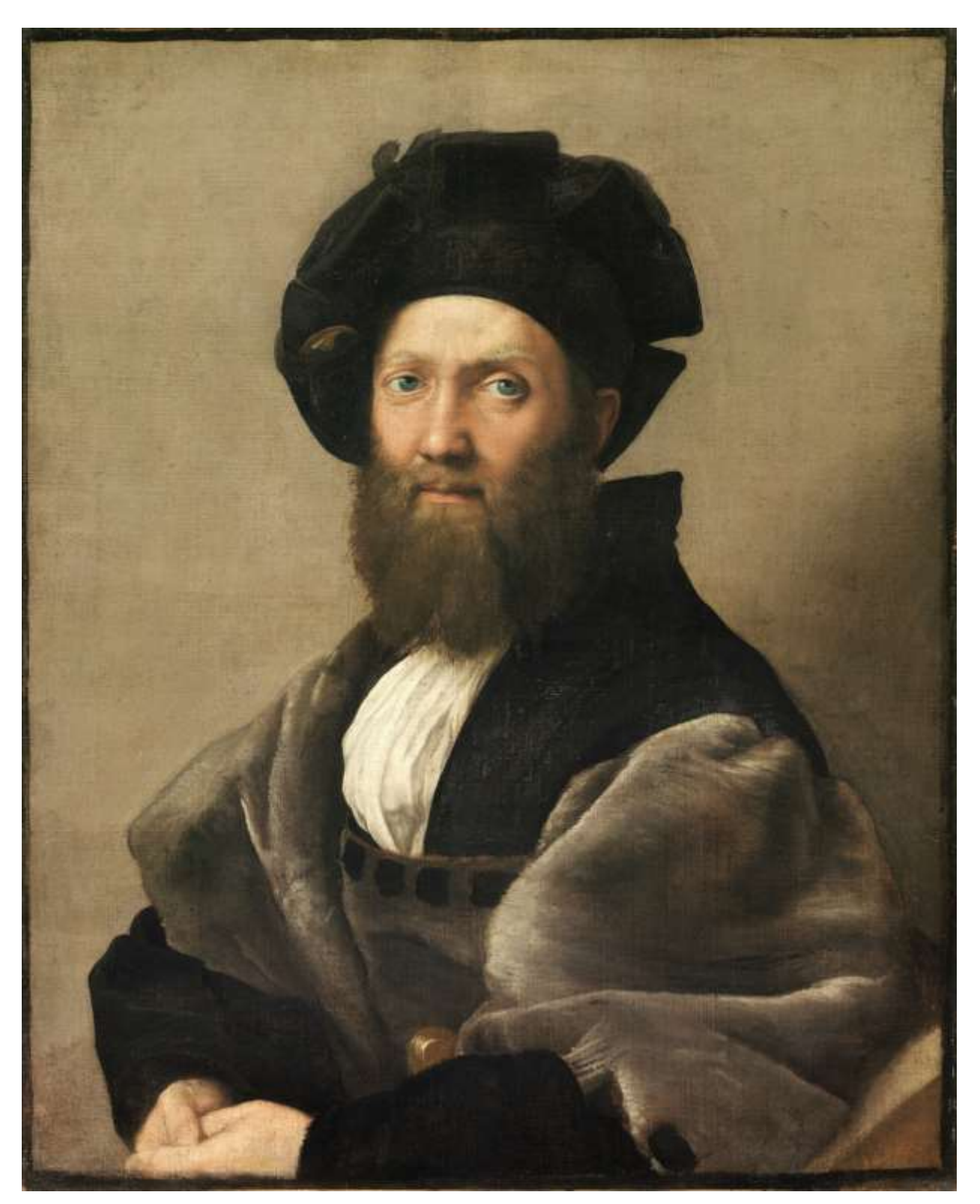
Denon wing - 1st floor - Grande Galerie - Room 8