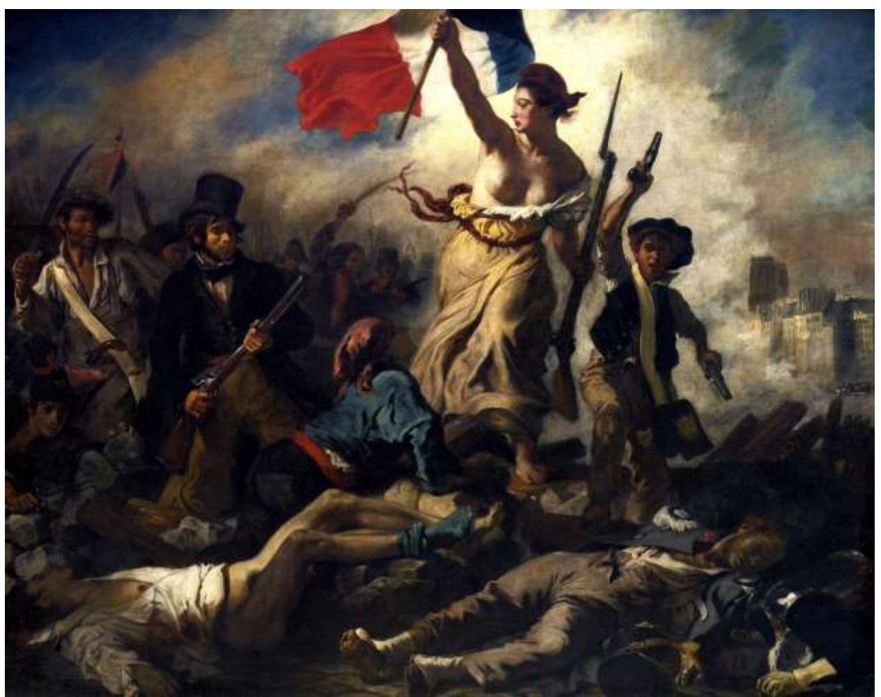
(French Romantic art, Liberty Leading the People, Delacroix, 1830)

Painting is a branch of plastic arts that represents a possible reality in two-dimensional artistic images created with the colors applied on a surface (cloth, paper, wood, glass, etc.). The goal is to get a composition with shapes, colors, textures and drawings that give birth to a work of art in accordance with aesthetic principles.