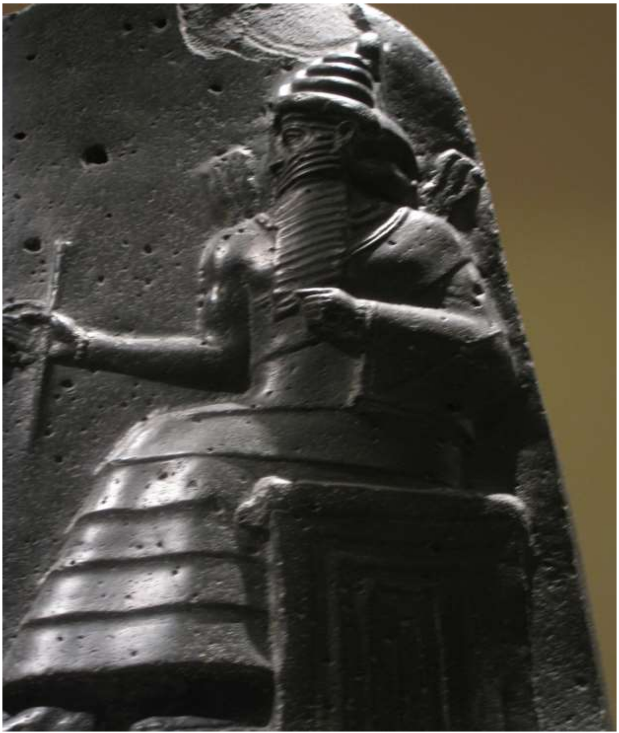
(Shamash, god of justice, detail of the Hammurabi code, https://commons.wikimedia.org/wiki/File:Code_of_Hammurabi_IMG_1936.JPG)