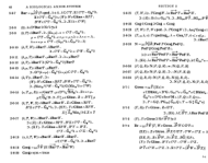
Fig. 3. Sample pages from Woodger's Axiomatic Method in Biology (1937).