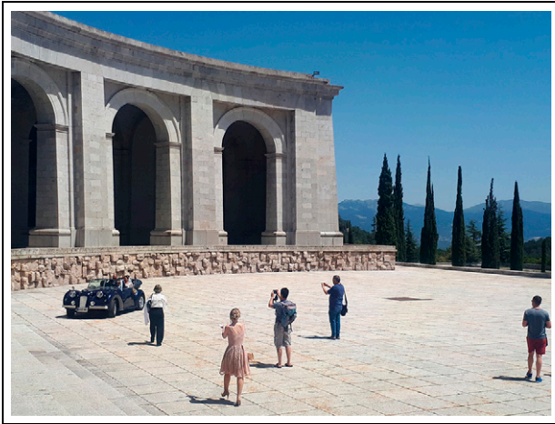
Figure 1. Arrival for a wedding at the Valley of the Fallen.

uncertain that reconciliation remains possible in such a contested context, their continued and admirable critical engagement in public debate has informed the recent proposal of a ‘Democratic Memory Law’. This law would turn the site into a civil cemetery and ban organisations that glorify Franco’s legacy. Elsewhere in Spain, artists and memory commissioners campaign against fascist symbols in more iconoclastic or carnivalesque ways, responding creatively and destructively – often at once – to the continued and unsettling presence of statues of Franco and other ‘pariah heritage’ (Ferrándiz, 2019, pp. S72–S73).