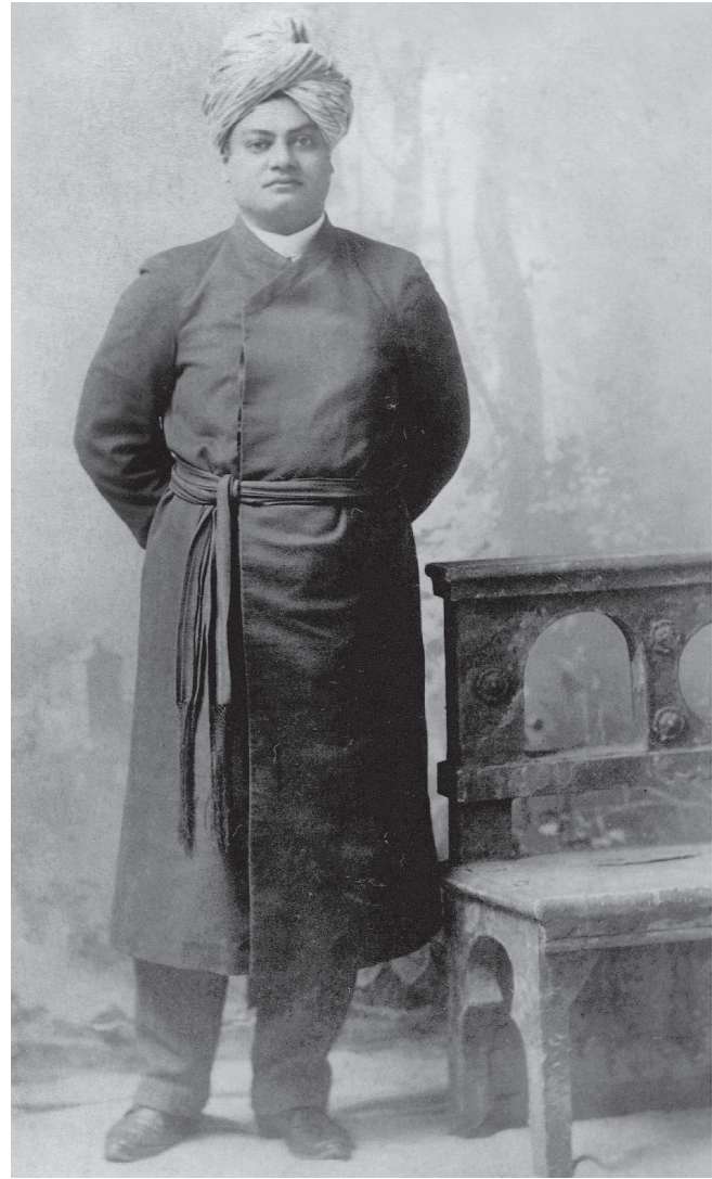
Swami Vivekananda in New York