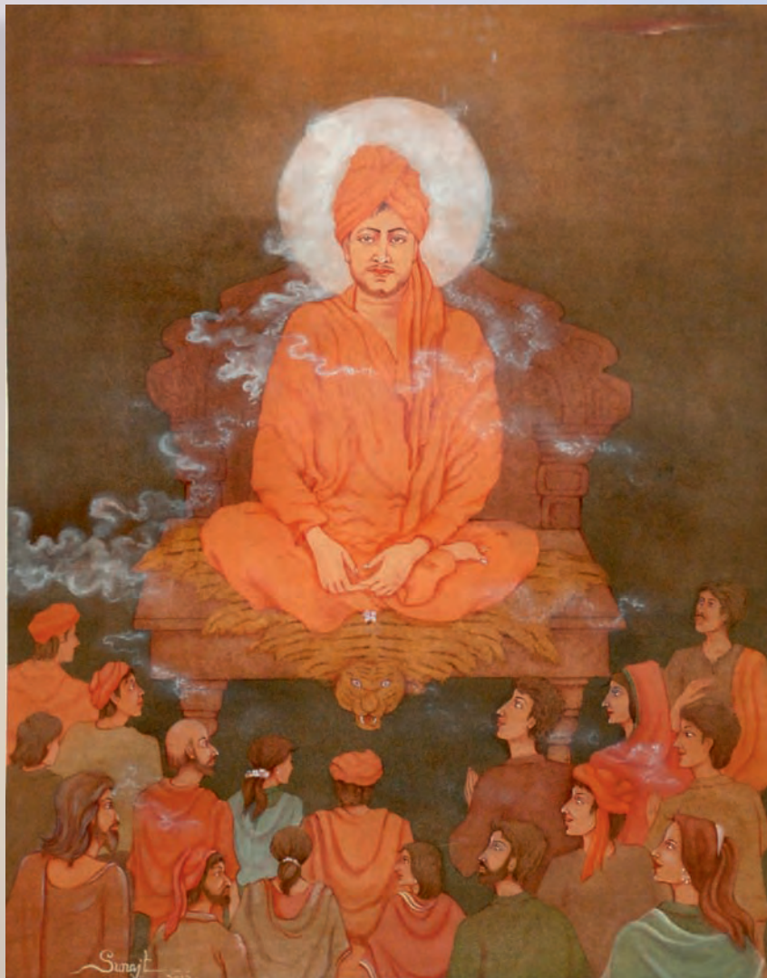
'RISE OF CONSCIENCE', BY SURAJIT MISTRY WATERCOLOUR (WASH)

personality, dogma, or doctrine. It does not even stress a rigid set of practices. It has no definite pattern, symbology, mythology, or ritual. The centre of this religion is the living being and its reason. Equipped with such reason, the living being is asked to embark upon the quest to find the truth, the truth at all levels. This is not against science but only true to the spirit of scientific enquiry.