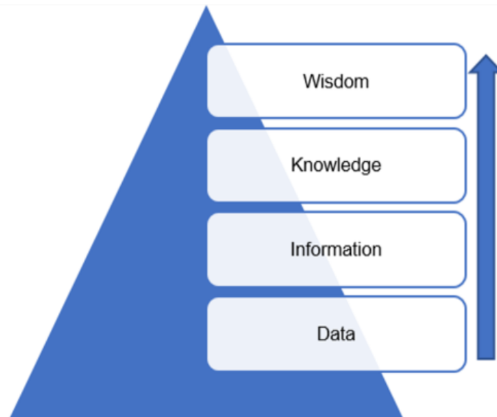
Figure 1. DIKW Pyramid

below, has been used for several years to show this difference (Fernanda & Salwa, 2018).