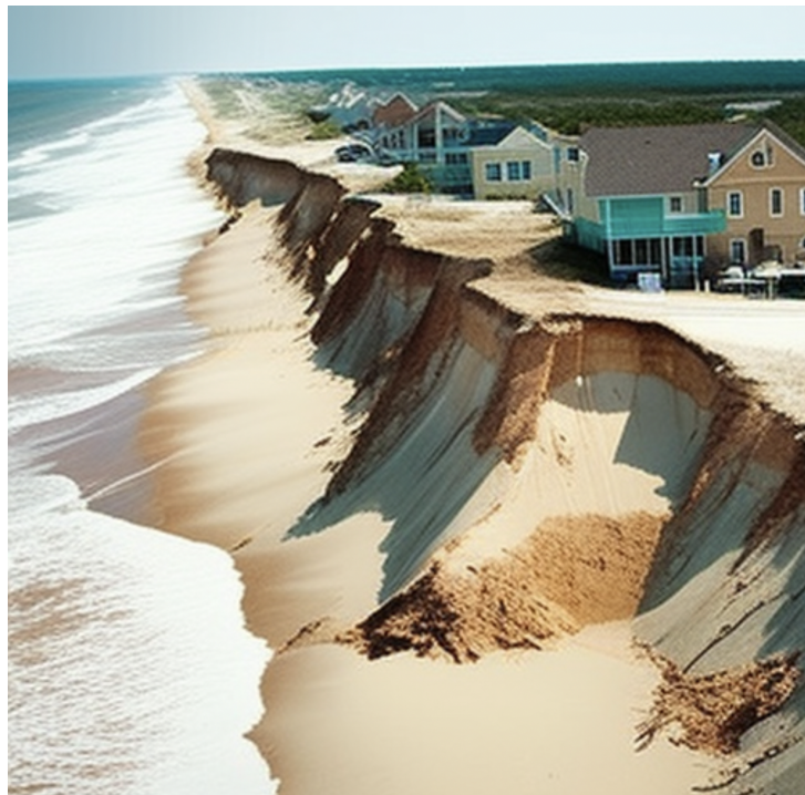
Figure 1: A version of the piece of late-binding scholarship specified above, rendered by ChatGPT for a politician, with an accompanying image also created by AI (generated by feeding the text in the screenshot into the Midjourney AI system).

Coastal erosion is a big problem that affects many communities, and it's something that politicians need to be aware of. This work argues that corporations are responsible for the damage that's being done to our coasts. By polluting and overdeveloping, they're contributing to the erosion that's putting people's homes and businesses in danger. We need to hold corporations accountable for their actions and recognize their liability. This work shows that by doing so, we can help communities address the issue of coastal erosion and ensure their long-term sustainability. As a politician, it's important to understand this issue and take action to protect our coasts and the people who live there.