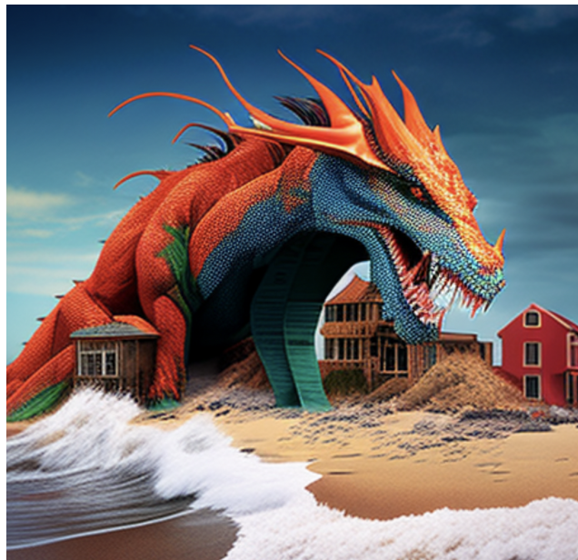
Figure 3: A version of the piece of late-binding scholarship rendered by ChatGPT for a reader in high school who likes dragons, with an accompanying AI-generated image. Late-binding systems can take user characteristics (such as a preference for dragons) into account in the text rendering process, which then may ripple into the image generation.

In this work, we argue that companies are responsible for the damage caused by coastal erosion. Just like how a dragon might destroy a village with its fire breath, companies can cause damage to the environment through their actions, such as pollution and overdevelopment. We believe that holding these companies accountable will help protect the people and creatures living in these areas, just as a brave knight would protect their kingdom from a dangerous dragon. By looking at past legal cases and using data and algorithms, we can help identify which companies are responsible for the damage and work to prevent future destruction. So just like how a dragon hoards treasure, companies must be responsible for the impact they have on the environment.