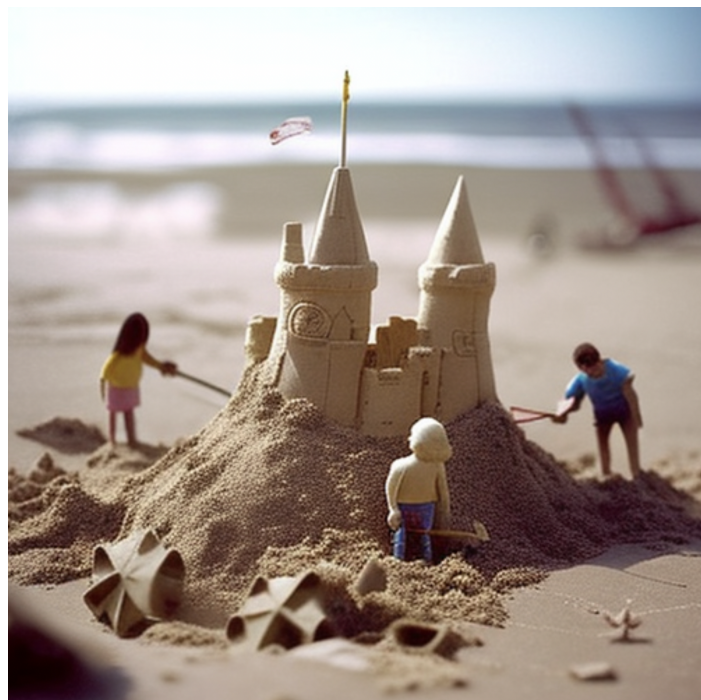
Figure 4: A version of the piece of late-binding scholarship rendered by ChatGPT for a reader in elementary school, with an accompanying AI-generated image.

"Imagine you're building a sandcastle on the beach, but the big kids keep coming and knocking it down. This is kind of like what's happening to some communities along the coast - their beaches are eroding away. Some people think that big companies, like the ones that make cars or run factories, are partly to blame because they've been polluting the environment and building too much near the water. This paper argues that these companies should be held responsible for the damage they've caused. The paper has a list of other papers and information that back up this argument. There's also a chart that shows how other cases like this have turned out in the past. By making these companies take responsibility for what they've done, we can help make sure that these communities have a chance to keep their beaches and stay safe."