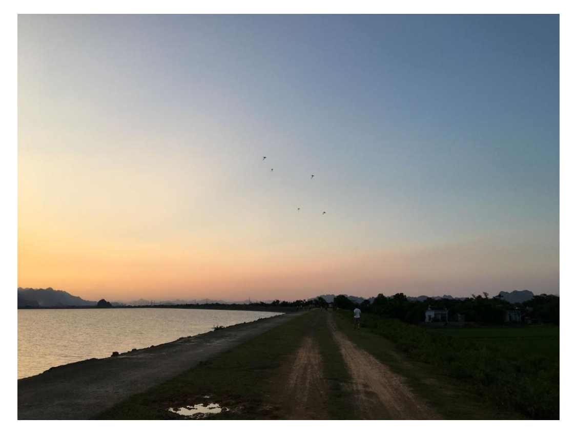
Evening at the riverbank, Cuc Phuong, Ninh Binh

nature of true freedom-having the ability to choose or being content with the choices available?