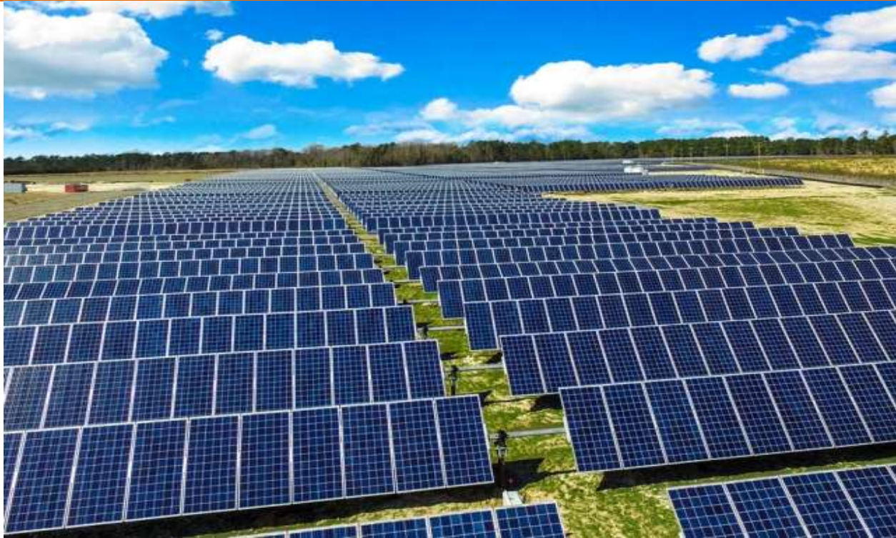
Figure1. Example of solar energy[3]