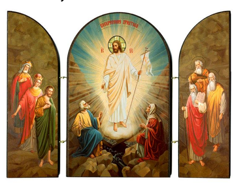
Figure 3. The Resurrection of Jesus, Christian Iconography