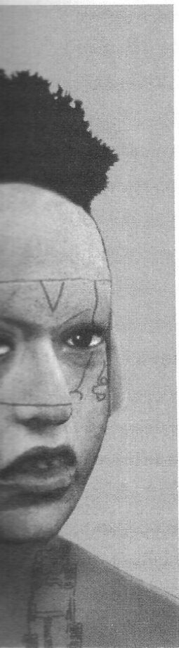
processed image, collaboration of Pierre

When it is assessed within the same context, Orlan's work emerges as behavior that can be read simultaneously as feminist critique of beauty