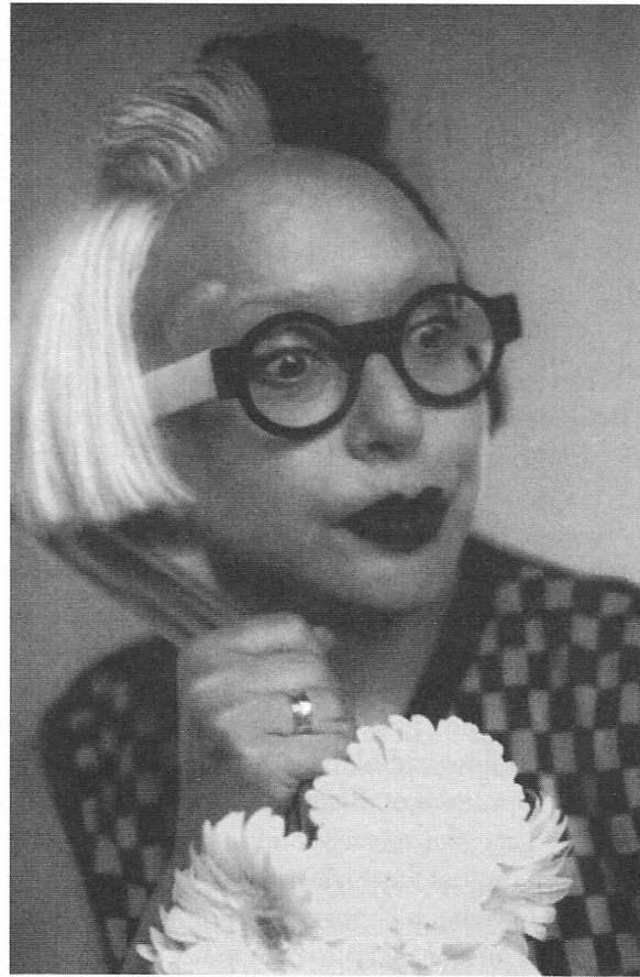
Portrait of Orlan. © 1997. Courtesy of the artist with the collaboration of Pierre Zovile.

simple “fix” to their physical problems: sagging breasts, crow’s feet, thick thighs. Her claim — “One thing is sure: it is through cosmetic surgery that men can exert their power over women the most” — reminds us that technology has made this possible and that, in the past, where male artists held the paintbrush and controlled the representation of women in the realm of high art, now male surgeons hold the scalpels and control the tucking, sucking, and erasing.