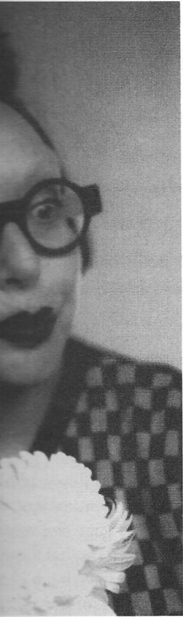
of the artist with the

sagging breasts, crow's feet, thick it is through cosmetic surgery that the most" —reminds us that tech- in the past, where male artists held presentation of women in the realm of scalpels and control the tucking,