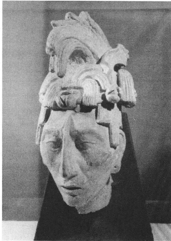
Lord Pacal, from his tomb in the Temple of Inscriptions, Palenque, 17th century, stucco. Museo Nacional de Antropología, Mexico City.

riations: some showing the Maya mother with filed-down, jewel-en- (available on CD-ROM) is a type es, is “not definitive” but is rather any things.” Humor even plays a