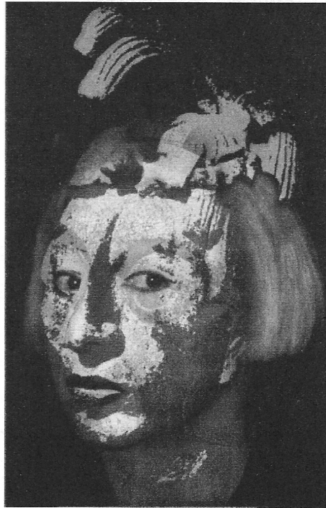
Orlan Pacal de Palenque. Digitally processed image, 1998. Courtesy of the artist with the collaboration of Pierre Zovile.

Other Orlan images offer many variations: some showing the Maya nose, another with crossed eyes, and another with filed-down, jewel-encrusted teeth. This collection of images (available on CD-ROM) is a type of catalogue of her work, and as she notes, is “not definitive” but is rather open-ended; “It’s possible here to do many things.” Humor even plays a