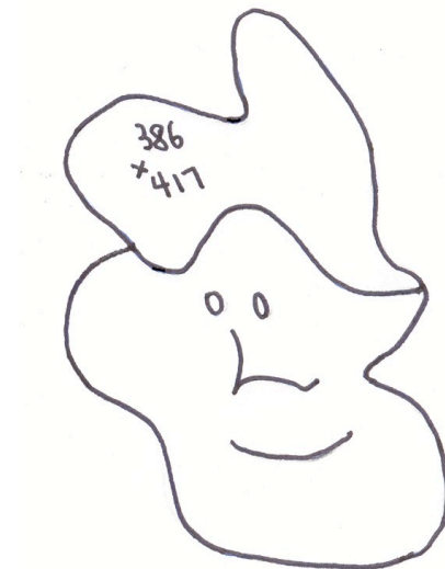
Figure 1: Traditional Computationalism