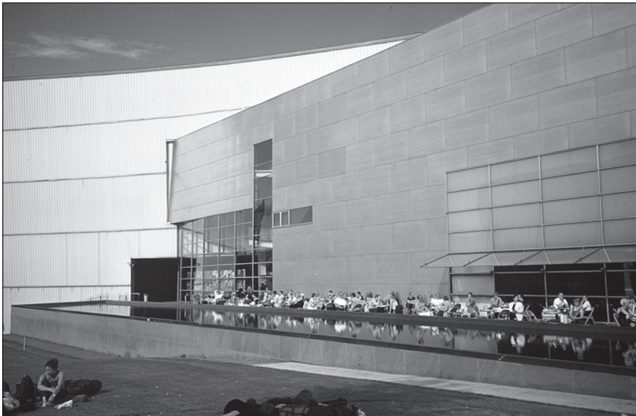
Ill. 10. In front of the Kiasma Museum of Contemporary Art in Helsinki, 1993–1998, Steven Holl.

It could be said that such means introduce nature directly into the city centre; however, this is done through the qualities of suburban architecture. While qualities such as slow pace and extensiveness are primordial and natural, through culture they are perceived as essential not for the recreational but rather symbolic role of the street named after Carl Gustaf Emil Mannerheim: a Marshal, a Regent, and a liberator of Finland whose role in the Finnish history is comparable to that of Józef Piłsudski in Poland.