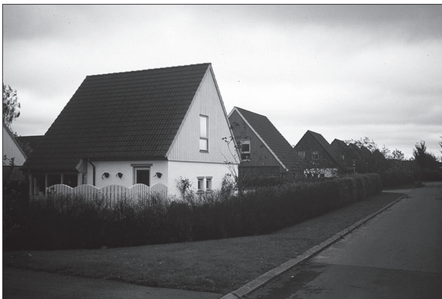
Ill. 9. Single-family houses near the Kold College — agricultural and gardening school in Odense.

In this case, the suburban penchant toward urban architecture does not consist in ‘tuning’ metal parts in order to achieve an imperfect version of metropolitan extravagance; instead, structures and materials typical of advanced technology were applied in a subdued, sensible and solid manner in the larger structures of the newer parts of the school, while other utility buildings were kept ‘in an honest manner’ in a cheaper and more conventional form with more resemblance to the older farm buildings.