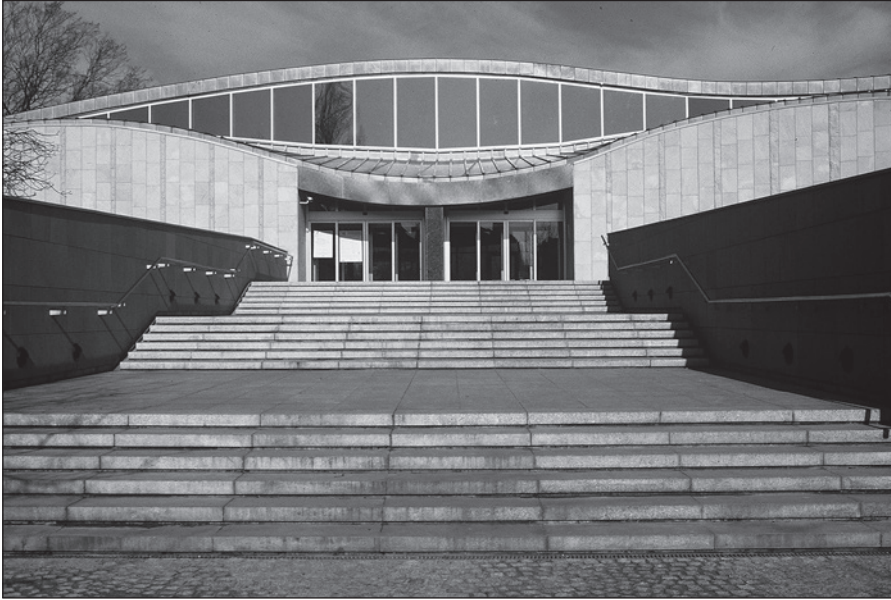
Ill. 6. The entrance of the Manggha Museum of Japanese Art and Technology in Kraków, 1990–1994, Arata Isozaki with Krzysztof Ingarden and JET Atelier.

deficient, sunken or flooded. On the contrary, it is the pavement and the bus station on the ground level that — seen from below — seem raised, isolated, noisy, and dedicated exclusively to traffic. The lowering does not bring to mind a ditch, but a green haven, especially considering that it offers both a place and a reason to stop there.