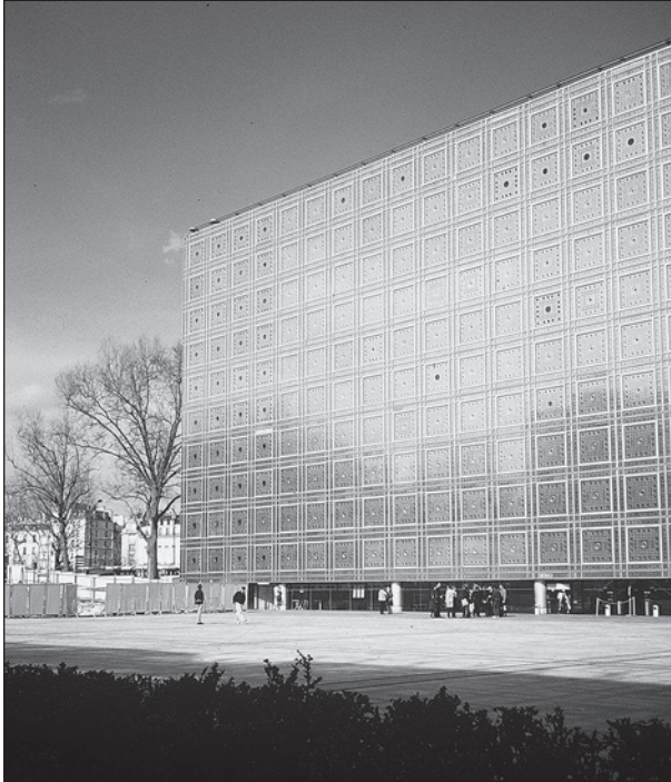
Ill. 4. The square in front of the Arab Institute in Paris, 1981–1987, Jean Nouvel.

The most visually interesting examples are neither the atmospheric but randomly distributed alleys, nor the quiet rooftop gardens or swimming pools (designed only to ‘increase the standard of living’ in the luxury apartment house, that local residence in time somehow manage to make their own), but the buildings and open spaces deliberately designed to offer qualities that we have described as suburban, especially those located in the inner city, surrounded by densely-packed buildings, heavy traffic, noise etc.