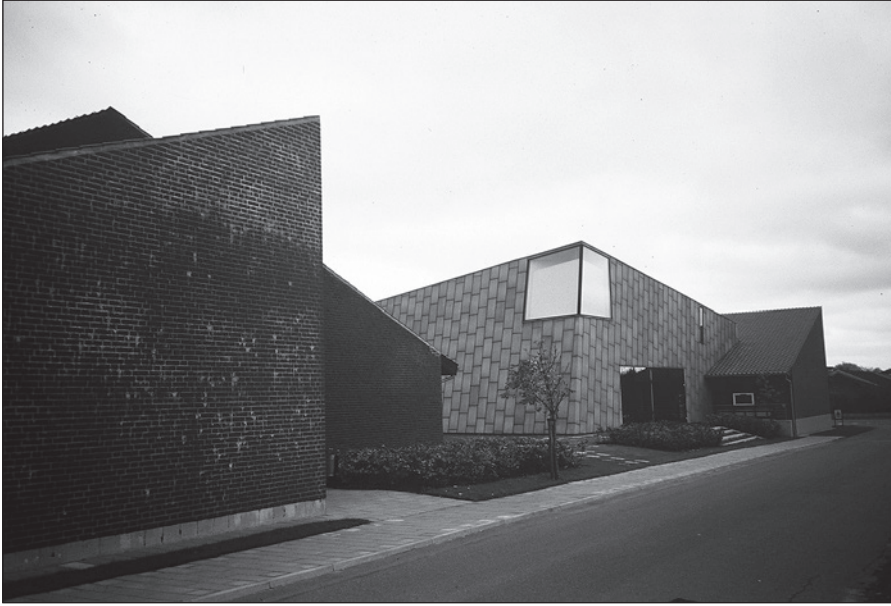
Ill. 8. Expansion of the Kold College — agricultural and gardening school in Odense in the 1990s.

abstract, geometrical shape is continued in the architecture of the buildings. Some of them are parts of an old farm, while others are a result of the extension realised in the 1990s. The visual contrast between the old and the new does not illustrate a gradual modernisation of the rural landscape nor does it serve to demonstrate the progress leading from past agricultural techniques to more advanced modern technology; however, it does create a tension characteristic of what has already been said about the city and the suburb.