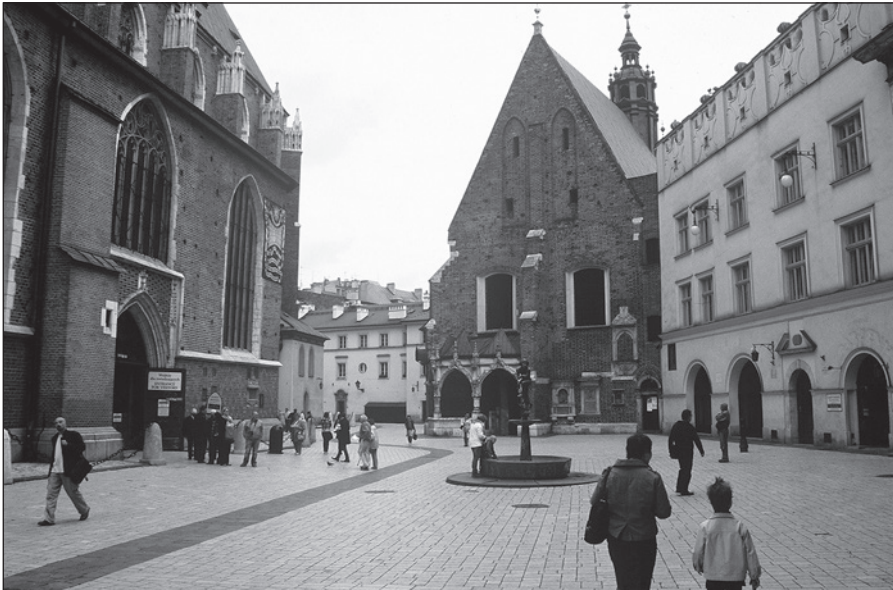
Ill. 3. The Mariacki Square in Kraków.

A similar thing occurs on the Mariacki Square in Kraków: the murmur of the fountain is heard, there are less people (as compared to the main Market Square and the neighbouring Small Market Square), and each passer-by or tourist is seen as an individual and not as part of indistinct mass. We have already mentioned that this pace and intensity is perceived in relative instead of absolute terms. It is enough that there is less traffic, less rush, and less activity as compared to the surrounding areas, as long as (visual) contact is maintained between the two that allows one to appreciate the difference while achieving a necessary distance so that the noise and the crowd not to disturb the peace of the enclave. These are the suburban qualities possessed by the Mariacki Square.