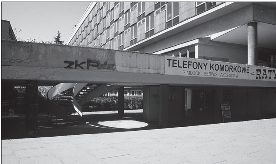
Ill. 5. Lowered pavement level under a terrace connecting the Cracovia hotel and the Kijów cinema in Kraków, 1959–1967, Witold Cęckiewicz et al.

Institute on one side and the University on the other — provide isolation from the noisy boulevard while limiting the view on the Seine. The size of the square (ca. forty meters wide and sixty meters long) provides enough space to experience the contrast between those resting and those in hurry (passers-by) between buildings being the destination for the latter as seen from retreats among the hedges. It is also small enough as to avoid getting lost and be perceived as more cosy than the surrounding areas, despite the complete absence of any attractions such as fountains, flowerbeds etc. The only elements are the motifs from the Institute's façade repeated on the pavement inviting another comparison — between the square and rectangular patterns of identical proportions appearing in glass and steel (and visible from afar on this perfect building) and the same patterns replicated in a lot cosier stone on the pavement within our reach.