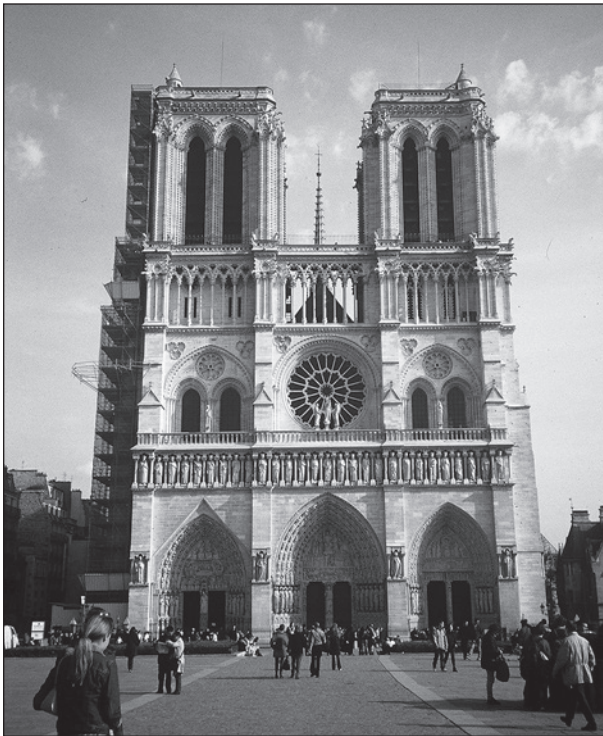
Ill. 2. Place du Parvis de Notre Dame in Paris, mid-nineteenth century, Eugène Emmanuel Viollet-le-Duc.

The second case — suburban enclaves within the city — include gardens or swimming pools on top of skyscrapers, places for walking dogs, sunbathing etc. , courtyards, parks, green squares, and other spaces where functionality, efficiency, and other parameters characteristic of urban landscape were deliberately disregarded or where their implementation failed.