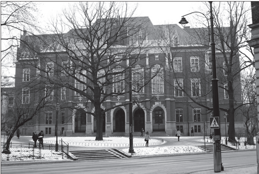
Ill. 1. Collegium Novum of the Jagiellonian University in Kraków, 1883–1887, Feliks Księżarski.

Collegium Novum, the main building of the Jagiellonian University (1883–1887) designed by Feliks Księżarski, is facing Planty in a way that seems obvious nowadays considering the appropriately elegant square situated in front of the building with a flowerbed and the ‘tree of freedom’ planted in 1919 on the first anniversary of Polish reclaimed independence. However, from the point of view of pre-modern urban hierarchy based on prestige the building’s placement is simply wrong, since it does not face either Jagiellońska Street or Gołębia Street, both leading to the Market Square i.e. the city proper. Indeed, Collegium Novum was not meant to face the Planty, but to face away from the Market Square, without being directly connected with the city centre by either of the above-mentioned streets.