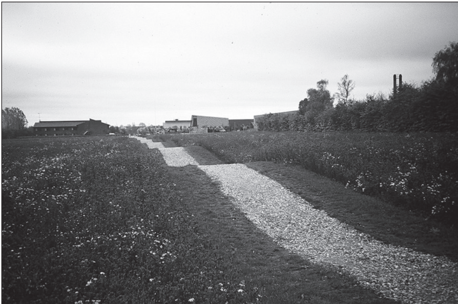
Ill. 7. A meadow leading to the Kold College — agricultural and gardening school in Odense.

both sides by massive, filled-in railing, while it offers a wider view upwards (on the museum itself) and downwards (on a patio at the lower level with a pool paved with stones, a wire sculptural installation by Aiko Miyawaki, and another ramp leading to that level). The final destination and the formal culmination — i.e. the entrance to the museum itself — turns out to be a mere opening in the ground-level wall, low, devoid of monumental quality, and topped with a soft wave of the roof and another one of the skylight. Still, it holds its ground against other urban attractions assaulting the senses that the visitor lost from sight a while back and have already forgotten. The oriental strategy of leading up to and gradually revealing the destination works equally well for Westerners (Chang, 2001: 205–215; Sasaki, 2001: 216–233; Slawson, 2001: 234–246).