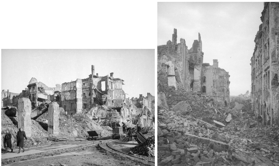
FIGURE 4. Warsaw after bombardment.

1.3.1. 1939 is regarded as the last year of the WSL. Twardowski and Leśniewski died before 1939. The invasion of Poland by Germany on 1 September 1939 and by the Soviet Union on 17 September 1939 began the Second World War. Poland was again divided, under the Nazi-Soviet pact of 23 August 1939. Warsaw was completely destroyed. Many key members of the L-WS were forced to leave Warsaw.