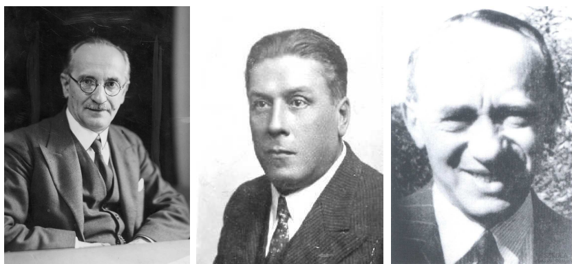
FIGURE 3. Jan Łukasiewicz, Stanisław Leśniewski and Alfred Tarski.

Łukasiewicz and Leśniewski were logicians and philosophers graduated at Lvov. They continued the philosophical thoughts, teaching methods and scientific research organization of Kazimierz Twardowski, but were protagonists of formal techniques in science, similar to those applied in mathematics. And the connection between philosophers and mathematics initiated by Janiszewski and his program for mathematical research manifested itself, among others, in the fact that Warsaw leading mathematicians (Wacław Sierpiński, Stefan Mazurkiewicz, Kazimierz Kuratowski) assigned a considerable role of logic to Jan Łukasiewicz and Stanisław Leśniewski, philosophers by educations. Both began teaching mathematical logic not only in the mathematical environment, but also in the philosophical one. Logic became an attractive subject to study in Warsaw. And even though the WSL was a joint creation of philosophers and mathematicians, logic – as a subject of its research – was not regarded as a part of mathematics or philosophy, but as an autonomous science.