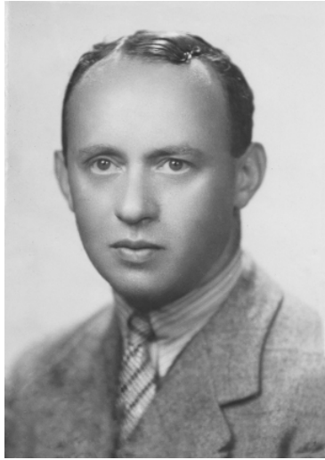
Fig. D.5: Alfred Tarski

Before emigrating to the United States in 1939, Tarski completed some of his most important work while working as a secondary school teacher in Warsaw. His work on logical consequence and logical truth were written during this time. In 1939, Tarski was visiting the United States for a lecture tour. During his visit, Germany invaded Poland, and because of his Jewish heritage, Tarski could not return. His wife and children remained in Poland until the end of the war, but were then able to emigrate to the United States as well. Tarski taught at Harvard, the College of the City of New York, and the Institute for Advanced Study at Princeton, and finally the University of California, Berkeley.