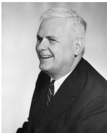
Fig. D.1: Alonzo Church

Church's academic achievements were great. Together with his students Stephen Kleene and Barkley Rosser, he developed