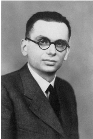
Fig. D.2: Kurt Gödel