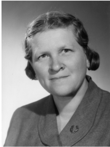
Fig. D.3: Rózsa Péter

Despite the importance and influence of her work, Péter did not obtain a full-time teaching position until 1945. During the Nazi occupation of Hungary during World War II, Péter was not allowed to teach due to anti-Semitic laws. In 1944 the government created a Jewish ghetto in Budapest; the ghetto was cut off from the rest of the city and attended by armed guards. Péter was