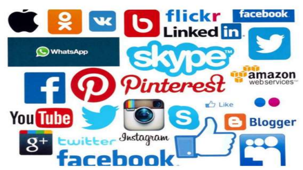
Figure 1: Logos of Some Popular Social Media Platforms (Wise, n.d.)

As shown in Figure 2, only Facebook and Twitter as social network services (SNS) and WhatsApp and Telegram as instant messaging apps out of many categories of social media are focused on in the study. Against the backdrop that many attempts have been made by other researchers to explain each of these social media platforms and their origins, this researcher did not include such in this paper.