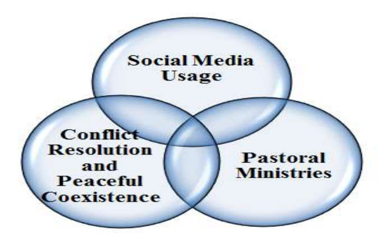
Figure 4: Interrelation of Social Media Usage with Pastoral Ministries and Conflict Resolution and Peaceful Coexistence

Therefore, based on most of the discussions above, there is a viable framework that church pastors of the Nigerian Baptist Convention can adopt. This framework encourages the deployment of social media in mediative dialogue and peacebuilding. This is against the backdrop that the world has metamorphosed into a digital one where social media is making tremendous impacts on the way people communicate with one another (Appel, et al., 2020). Thus, every pastor should be ready to explore and use as many aspects of social media as possible depending on which of the social media are common to their church members in their pastoral ministries to promote the peaceful coexistence of their church members and other people in the society and resolve conflicts (especially through mediative dialogue) among them. The interrelation of the three themes is depicted in Figure 4 below. This will likely promote sustainable peace in churches specifically and the society at large. It will likely make Goal 16 of the Sustainable Development Goals of the United Nations – promoting peaceful and inclusive societies for sustainable development – more achievable before 2030.