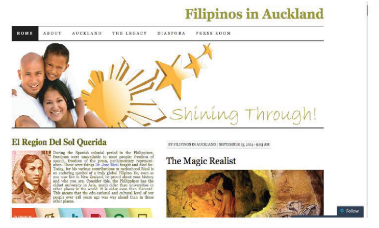
Figure 1: Screen grab of homepage of Filipinos in Auckland featuring an image of a nuclear, heterosexual family on the website banner

because its character, as far as the depicted image is concerned, conforms to a dominant heterosexist and elementary imaging as seen in the official texts analyzed prior.