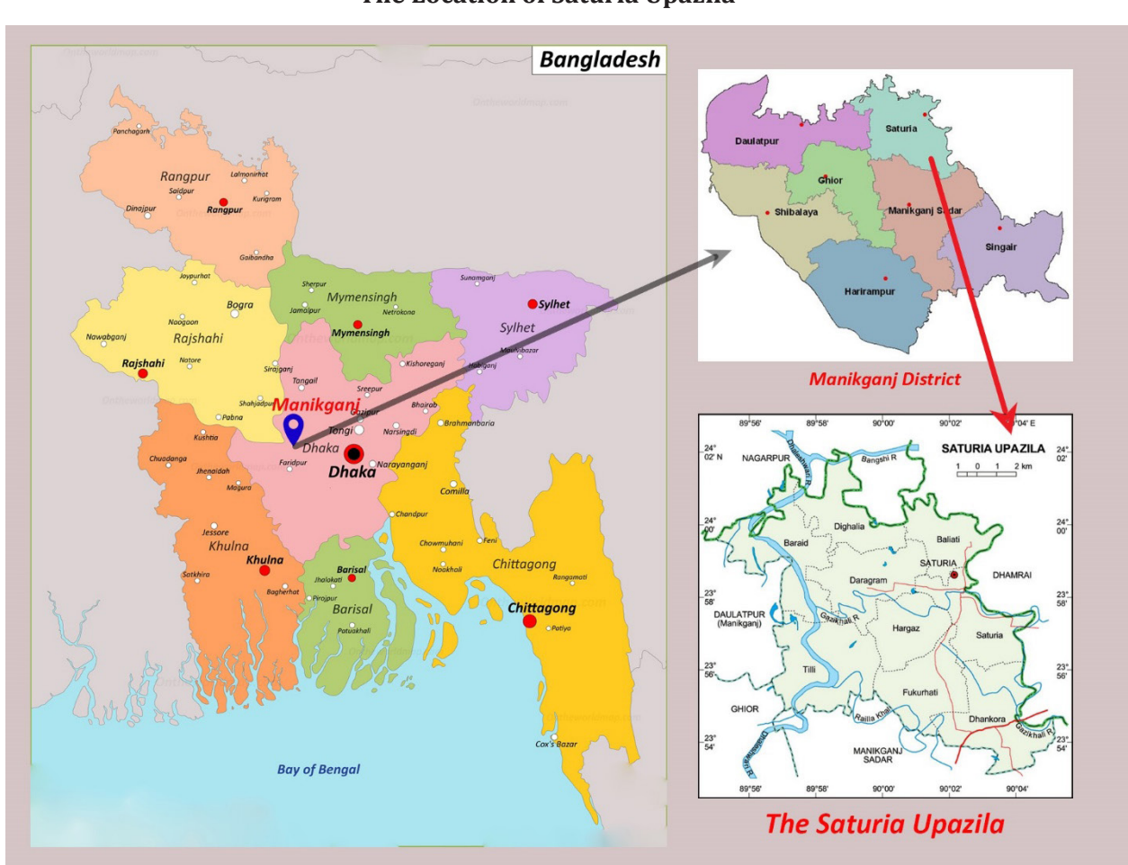
Figure 2. The Location of Saturia Upazila

At the Upazila level, several government departments implement policies and schemes of the national government. Representing the government, UNOs supervise and coordinate the activities of these departments. Some departments implement different development plans and programmes at the local level. Some selected functions of most of these development-oriented departments are transferred to Upazila Parishad (UZP). UZP is the local government body, headed by an elected Chairman. An Upazila has several Unions under its geographical and administrative jurisdiction. Elected Chairman(s) of these Unions are de facto members of the UZP. The respective Member of Parliament (MP) is an advisor to the UZP. UZP is mainly responsible for planning and