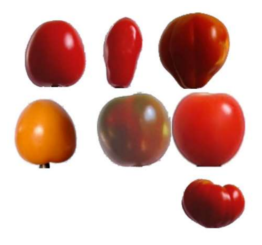
Figure 1: Dataset Tomato Samples

The images were resized into 150×150 for faster computations but without compromising the quality of the data.