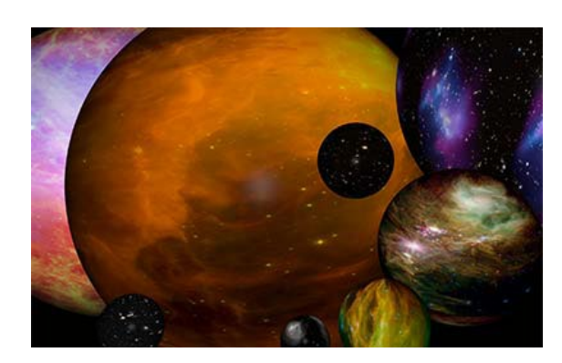
Attribution: By Silver Spoon (Own work) [CC0], via Wikimedia Commons

In my teens, I causally picked up a magazine on electronics. I quickly became fascinated with how transistors, diodes, and other components combine to make up a radio or a television. That led me to study electronics at RMIT (now called RMIT University), with electronics becoming my first career. What intrigued me then and still intrigues me today is how only four fundamental physical forces combine with the properties of an unseen but small number of fundamental particle types to create the