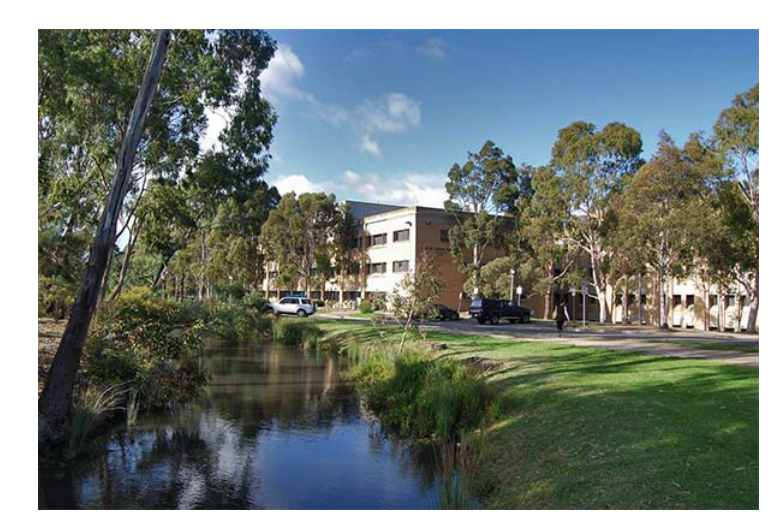
La Trobe University

nine years while I worked full-time and started a family. I became interested in two key areas in philosophy. Firstly, epistemology; that is, the philosophy of knowledge and ethics, or moral philosophy. With the former, we ask questions such as: how do we know what we do know and how does the scientific method work? In moral philosophy, we enquire into the nature and foundation for ethics, and how we decide rationally the key moral questions of our time.