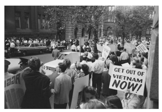
Anti-Vietnam War demonstration at Phillip Street Court, Sydney, NSW

dazzling complexity of the world we see. In all of my studies, what really stood out for me was one key lesson: that by using the scientific method, we can make sense of the world. We can understand what causes disease, what makes bodies attract and how humans evolved on this planet.