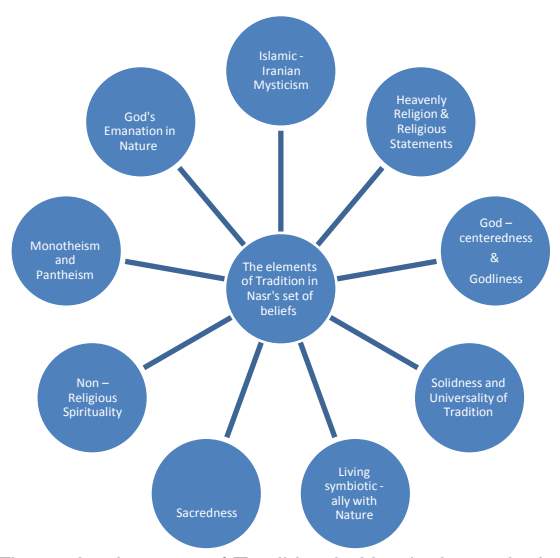
Figure 1 . The main elements of Tradition in Nasr's theoretical system of thought

The major difference between the traditional and modern sciences, as he explains, is "in the fact that modern studies are variable while in the traditional ones, the change happens clearly, and the continuity takes place through the study of symbols" (Nasr, 2004). The main elements of Tradition, in Nasr's theoretical system of thought, can be formulated in the following figure.