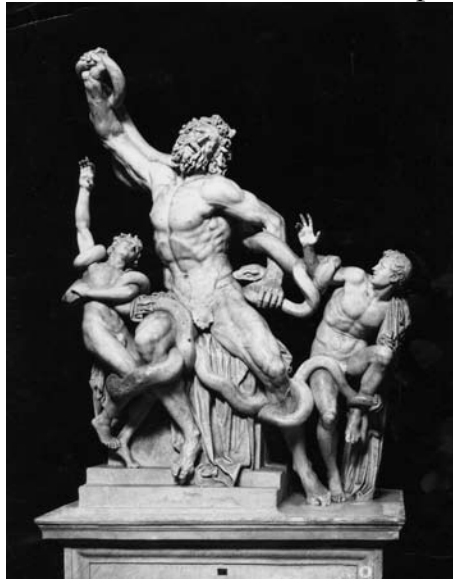
Fig. 7. The Laocöon group. Roman copy, perhaps after Agesander, Athenodorus, and Polydorus of Rhodes. 1st c. CE. Marble. H: 2.1 m. Vatican Museums, Vatican State.

be the claim that the statue to which Pliny refers was originally cast in bronze rather than being carved in marble which does not, of course, preclude any number of marble or indeed bronze copies.