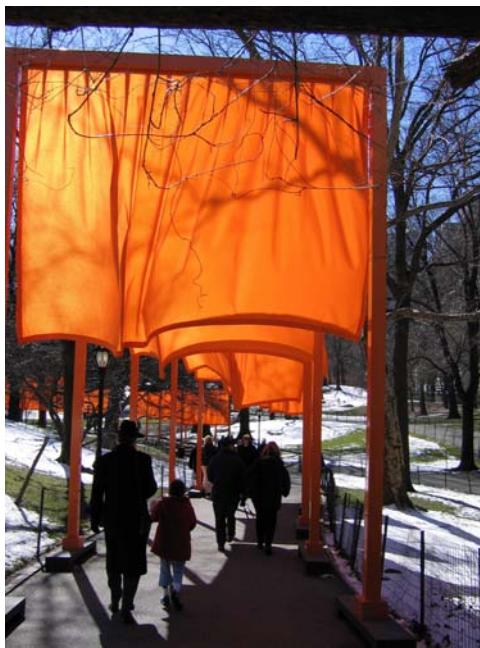
Fig. 11. ‘People Wash’ or strolling through Christo and Jean-Claude, The Gates. Central Park: New York City, February 22, 2005

You, that is: I—that is: we, have to change.