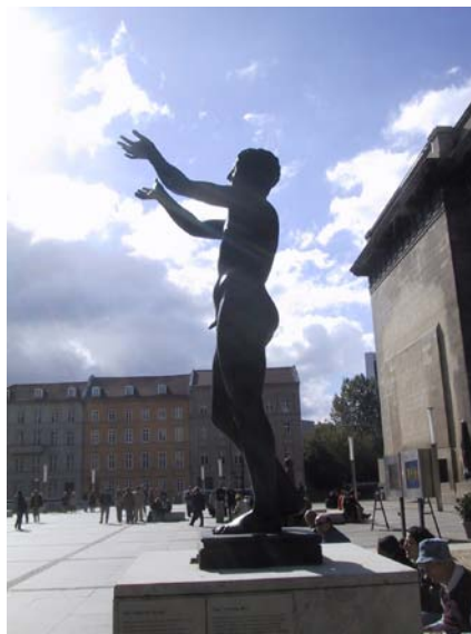
Fig. 8. Bronze Statue. Pergamon Museum, exterior; Berlin. September 2004; author's photograph.

considerable obstacle, it does not quite resolve the question of Pliny's key, but stock, claim that the statue was made from one stone: ex uno lapide . 50 But if we are indeed talking not of a single block of marble but rather of a large scale bronze, newer discussions of the casting of such bronzes, such as Konstam and Hoffmann's, also serve to make more sense of this plurality (three sculptors, one plan). 51 But to follow Andreae here: if the statue of Pliny's description was in fact bronze (or, and this too, to be sure, only displaces the question: if the original was a bronze), the question still remains for us: what did it look like as such a bronze (copies of the Laocoön rendered in bronze are extant but modern casts of the sort cannot answer this question for the reasons given above).