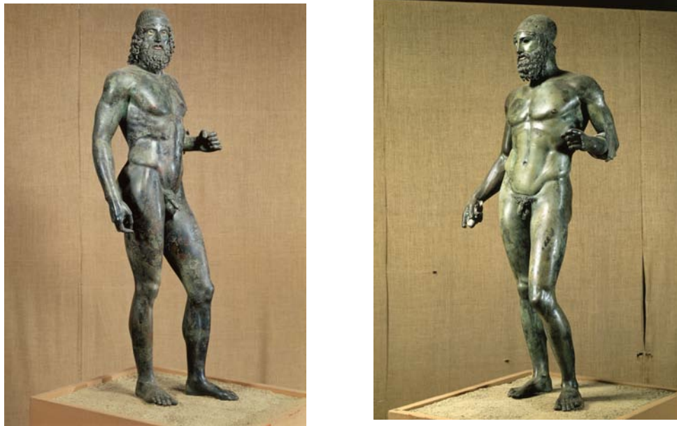
Figs. 4 and 5. Bronze, early mid 5 th c. B.C.E. Riace Warriors “A” (77 5/8 in.) and “B” (77 5/8 in.)

phenomenological reflection and as hermeneutic and phenomenological, this would be a philology beyond philology, a meta-philology.