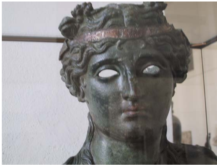
Fig. 6. Bronze Cast, note color differences. Pergamon Museum. Berlin. September 2004.

thought that one could hardly take them literally enough)? And what would that mean?