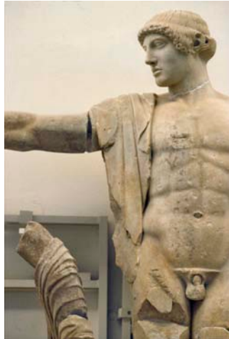
Fig. 10. Apollo from pediment of the Temple of Zeus, Olympia, 5th BCE. Archaeological Museum, Olympia, Greece

But is this no more than fetishism? We are taught that the Greeks are canonic even before we turn to art history. Does not this determine what we find ‘classically’ beautiful? This is an old problem and I risk perpetuating an old prejudice. Greek sculpture’s the thing, only substitute the warmth of bronze for the cool of marble, Nietzschean color (Dionysus!) in place of Winckelmannian white (Apollo!).