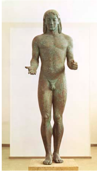
Fig. 3. Piraeus Apollo, ca. 540-545 BCE, 75 5/8 in. National Archaeological Museum, Athens, Greece

The Greek found himself against and in tension with such statues, his own bodily being highlighted against an imaginary exemplar, just as he might also find himself agonistically reflected by an opponent. Such quasi-Lacanian imagery may also shed new light on Homer's recourse to the hero's 'shining limbs' [ Iliad , 16.805] just as the Homeric epic celebrates agonistic tension together with all its complexities and if the tradition Havelock recounts is right (as I am inclined to suppose that it is), 25 that same competitive Homeric tradition, gave the Greeks nothing less essential than the mirror in which they could find themselves, as Nietzsche recalls this tradition to us: the song sings of what Greeks do and so tells the Greek how to be Greek.