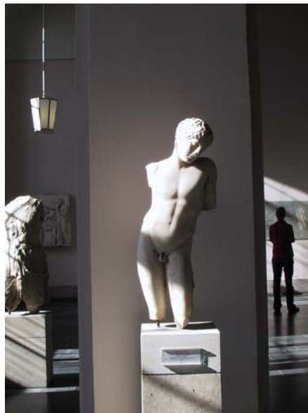
Fig. 2. Pergammon Museum: interior. Berlin, September 2004.

New accounts of mirror neurons (popular in philosophy across the analytic-continental divide), might support an elaboration on the projected echoing of sensibility inspired by human-sized statues. Yet the