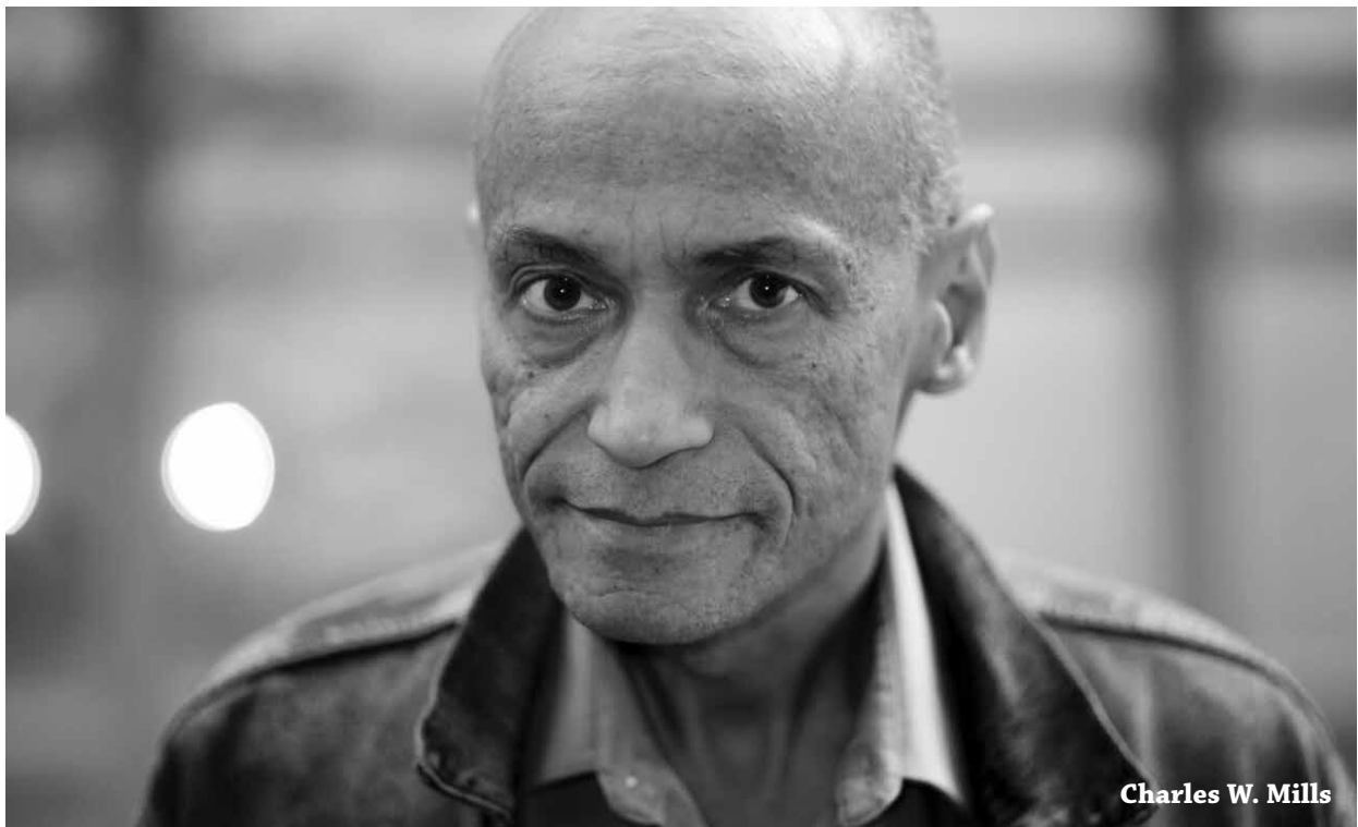
Charles W. Mills

thinkers that inevitably have blind spots; rather, our blind spots have deformed our theories. He argued that the very conceptual framework of political liberalism is more of an obstacle than a guide to progress, inasmuch as it fails to track salient social conflicts or provide a method for redressing a shared experience of oppression. Philosophy, then, loses practical efficacy to be a meaningful guide for change. In the Marxist spirit with which he launched his career, his work remained steadfast in affirming that the point of philosophy is to change the world. In the last talk I would hear him give at Harvard University in 2019, a preview of his Tanner Lectures, he observed that given its glaring omissions, it appears as if the dominant liberal paradigm is not for our world, for our times, or for people like us , namely, victims and perpetrators of injustice. If philosophers cannot show how the ideals that underpin a theory can take root in the actual world, then in the struggle for change we are, at best, fair-weather friends just there for the good times. At worst, we stand complicit in racist brutality, like quack doctors who prescribe noxious elixirs when one has asked for a glass of water. In other words, “white-stream” philosophy has been worse than useless. The gross mismatch between