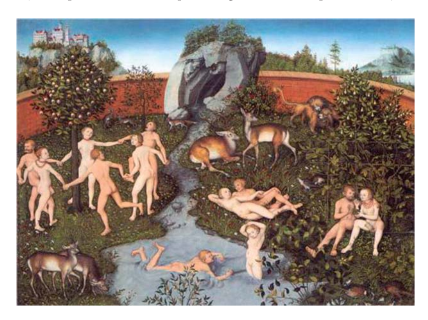
The Golden Age by Lucas Cranach the Elder c. 1530

our true identity in divinis . In the Golden Age integral spirituality was the universal Norm, and it is this integral spirituality that has become progressively obscured in the later phases of the temporal cycle. "The krita yuga is the perfect age, and therefore it is also called the satya yuga ; that is, the 'real', true, or authentic age. From every point of view it is the golden age, the beatific epoch ruled by