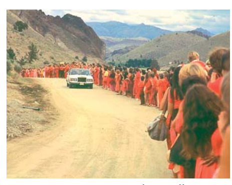
Rajneesh in Rolls Royce

the pathologizing of religion and spirituality, we see that the ancients had foreseen the dissolution of the modern and postmodern world and had not only