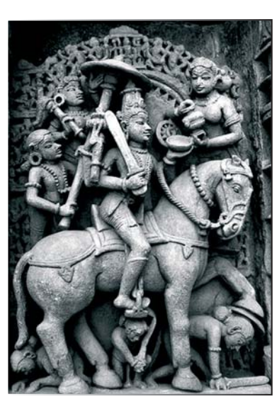
Kalki Avatar, Rani Ki Vav, Patan, Gujarat

In examining the traditional cosmologies both of the East and West, we find a common perspective in the notion that time is divided up into four periods, known collectively in Hinduism as the Manvantara: Golden Age (Krita-Yuga or Satya-Yuga), Silver Age (Treta-Yuga), Bronze Age (Dvapa-