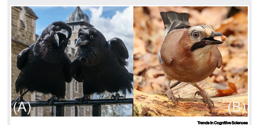
Figure I. Two Corvid Species Commonly Used in Comparative Cognition Research. (A) Ravens; (B) Eurasian jay.

Selfhood: magpies have passed the mirror-mark test [69]. There is also evidence that corvids recognise that they have different perspectives/desires from others. For example, jays use information from their own experience as a pilferer to make inferences about opportunities for theft by others [74]. Male Eurasian jays (Figure IB) feed their female partner the food she would like to eat, adapting to her changing desires [92]. Further research is required to explore the link between these abilities and self-consciousness.