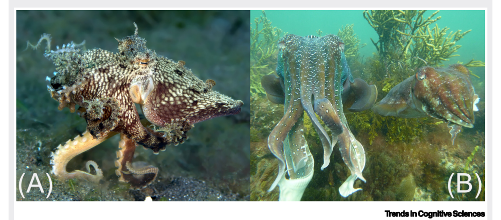
Figure I. Two Cephalopod Groups That Are Suitable Candidates for Investigating Consciousness. (A) Octopus; (B) cuttlefish.

Selfhood: there is no compelling evidence of cephalopods possessing self-recognition [115], but the question calls for systematic exploration. Their sophisticated abilities to camouflage, disguise themselves as inanimate objects [116], and mimic unappetising/venomous animals [117] (or even algae, as in Figure IA), suggest some grasp of how their body appears to others.