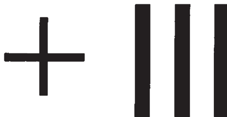
Figure 3: The distance between the midpoints of the bars is slightly over one fourth the distance between the plus and the midpoint of the middle (crowded) bar. This ratio should be comfortably crowded for most observers—you should not be able to move your attention from bar to bar—but hopefully it will not look to many people as if there is no middle bar.

that middle item “disappears.” As I said, my method is to combine introspections from clearer cases with experimental results to infer the system behind these judgments about conscious perception.