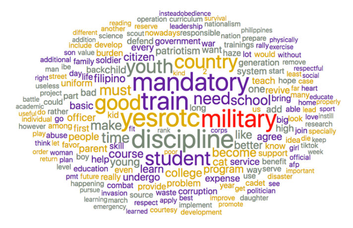
Figure 1. Word Cloud

Figure 1 presents the Word Cloud of the frequently used words found in parents' sentiments on the mandatory ROTC in senior high school. The visual representation highlights the most commonly used words through more extensive texts. As seen on the word cloud below, the most frequently used words are ROTC , train , discipline , yes , mandatory , military , good , student , youth , country , and need .