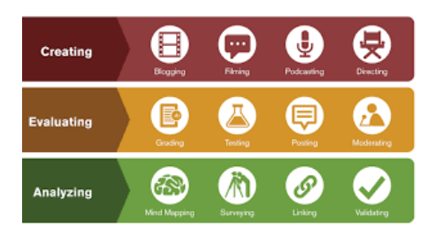
Figure 1: Bloom's taxonomy to integrate technology (cf. [15])