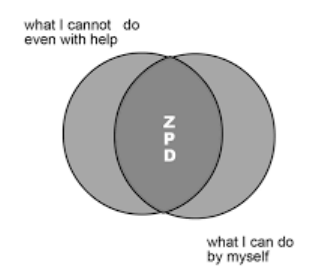
Figure 2: Vygotsky ZPD