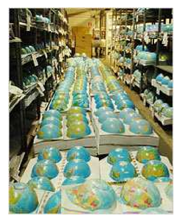
Figure 1 Visualizing the 'Superpopulation' Assumption

Manufacturing Globes in Italy. The assumption that we can treat the world as part of a 'superpopulation' is something like the idea that endless worlds roll off an assembly line, usually with the additional assumption of indeterminism - that each world is different from the others.<sup>3</sup>