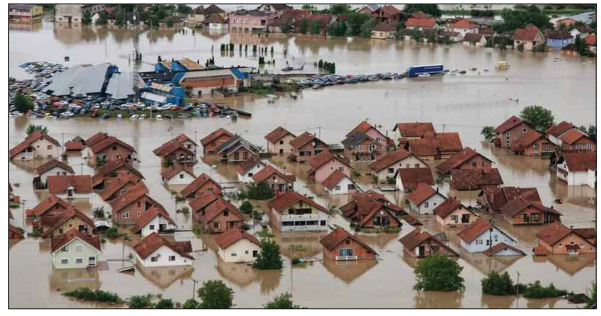
Floods in 2014

I have my doubts. If political leaders on each side of the Neretva in Mostar can-