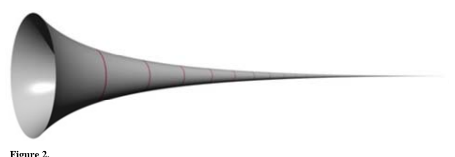
Torricelli's trumpet (Image from http://en.wikipedia.org/wiki/File:GabrielHorn.png).

However, the horn evidently exists in the abstract, mathematical realm where the infinitely large and infinitely small readily co-exist. Without finite molecules to worry about, we can see that the horn's internal volume is also infinitely long as it extends into the endless and infinitely narrow tube. Obviously, a volume with an infinite dimension is definitely not finite. This presents no difficulty because \pi is not a finite integer. It is a transcendental number and has an infinite decimal expansion with cardinality \aleph_0 . Using Cantor's results, we can see that there is a one-to-one correspondence between the points in the horn's volume and the points on its surface. In fact, we already mentioned earlier how the numbers of points on any surface and in any volume are infinite, with the same cardinality c .