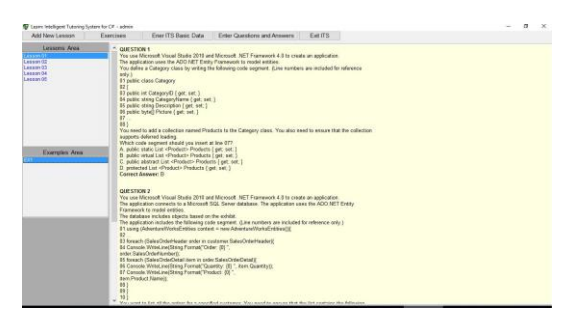
Figure 3: In this interface student chooses examples required to take advantage

Figure 2: In this interface student chooses the desired lesson to learn