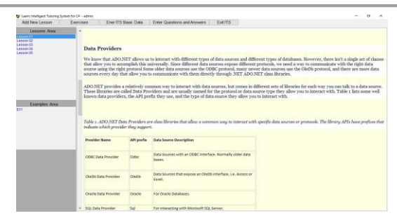
Figure 2: In this interface student chooses the desired lesson to learn