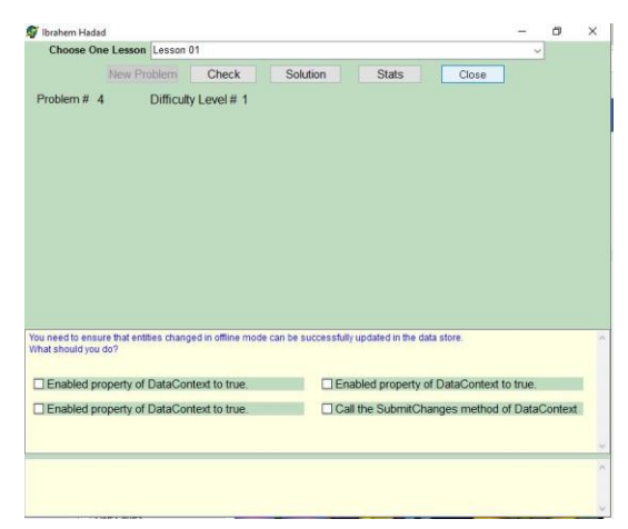
Figure 4: In this interface student chooses question to try and answer it.