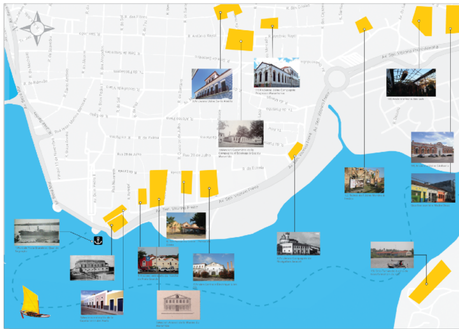
Figure 02: Proposed Route of the Industrial Landscape of São Luís.

In the first moment, to start the project it is necessary to bring together the three museums to align the speech of how to receive this request from people and how to prepare for this novelty. Advertising and museum disclosure will be changed to allow greater visibility of access to these places, which today are limited by the shore, instead of being better connected. For the expected results we plan to create a new dynamic of the tourist market in São Luís. Gradually will seek to strengthen the value network and open new doors to other ideas through collaborative processes and platforms that use technology to our advantage. The urban water should not be a barrier in the knowledge of the territory and its riches, it will have to allow to reach even further in the imaginary fluvial and all these stories.