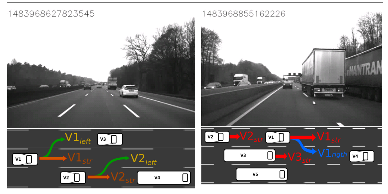
Fig. 2 Top: Screenshot of a Cut-In scene. Bottom: Birds-eyeview representation of the traffic situation and the behavior options for the autonomous vehicle V1 and the relevant other traffic participant V2