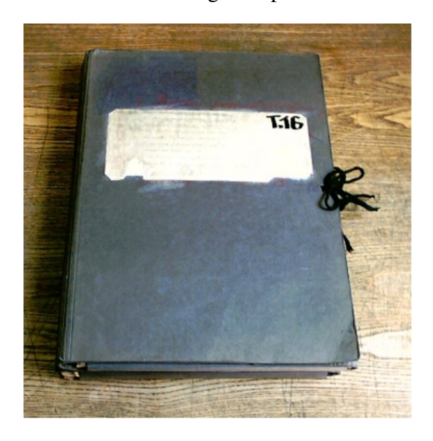
Figure 1: Twardowski's archive, Library of Warsaw Philosophy Institute

the thoughts Twardowski had a century earlier. Now, the question is that of the nature of the relata. No miracle, of course, is involved, because the relationship between myself, as a material creature, and the products of the mental activity of a philosopher I have never met is mediated by the book. I am physically related to my copy of that book, the inked inscriptions on the book impress my retina, I recognize in those inscriptions familiar words and sentences and, as a competent English-reader, I access the linguistic meaning of those sentences, which delineate the thoughts Twardowski had in his head at the time he wrote them. This is a well-known story: our capacity to access the token of the words they drew on paper; and (ii) our perceptual capacity to access the meaning of those words (now considered, not as concrete inscriptions or 'tokens,' but as linguistic 'types'). Nevertheless, crucial details of this familiar story differ, according to whether we are dealing with printed books or digital devices.