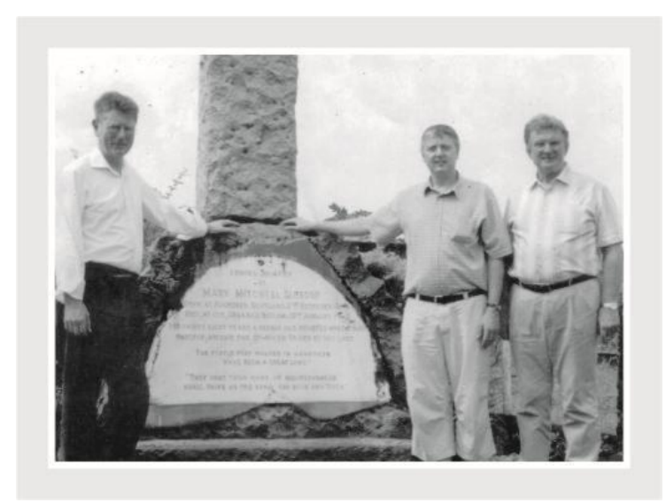
Plate 7. Contemporary rendition of tomb stone sculpture