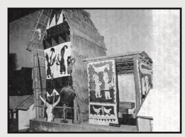
Plate 4. Typical examples of "Nwommo" (Warrior Shrines of Ekong Society