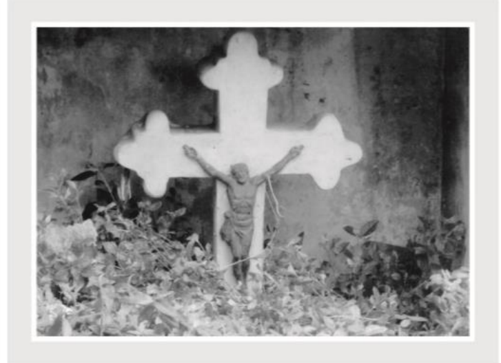
Tomb Stone with Christian Cross Symbol